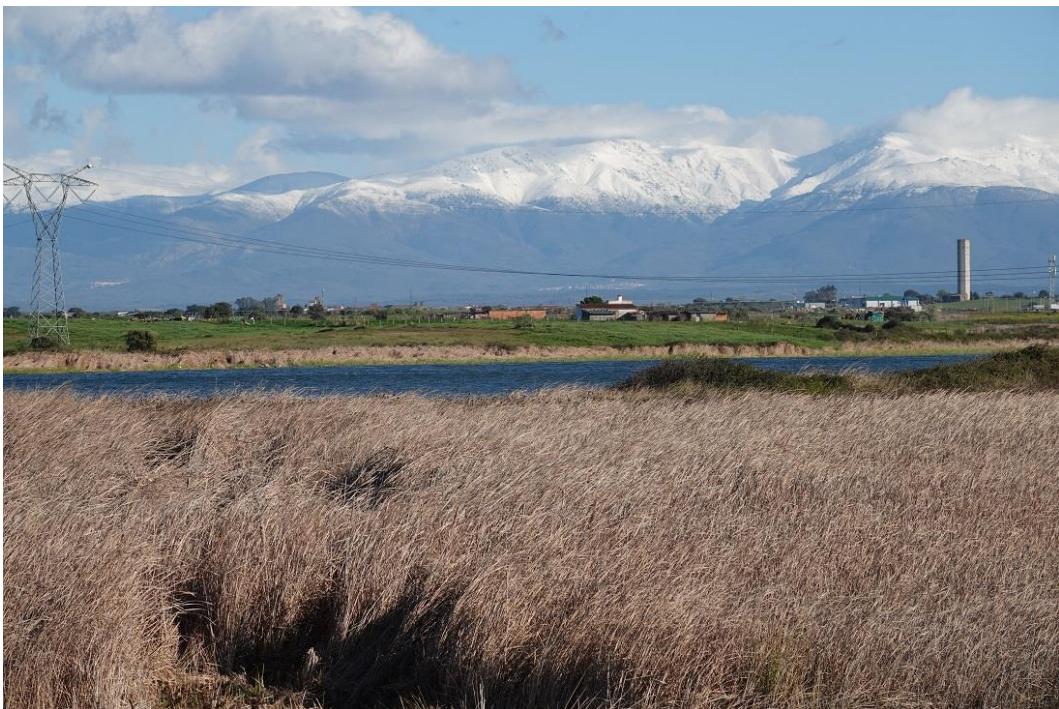
Arrocampo and Gredos Mountains

After all too short a stay it was time to bid farewell to Casa Rural el Recuerdo and return to Madrid. But not before some final birding at the Arrocampo Reservoir. The sunshine was tempered by a very fresh westerly wind, but we had a spectacular view of the Gredos Mountains, dressed by a heavy fall of snow. The wind made the viewing conditions across the marsh quite difficult, but nevertheless we managed sightings of Western Swamphen , Ferruginous Duck and Squacco Heron (the latter rather distantly). Barn Swallows and Sand Martins hawked low over the water. Cetti's Warblers gave their explosive songs from all sides and we also heard a few snatches of the reeling song of Savi's Warbler .