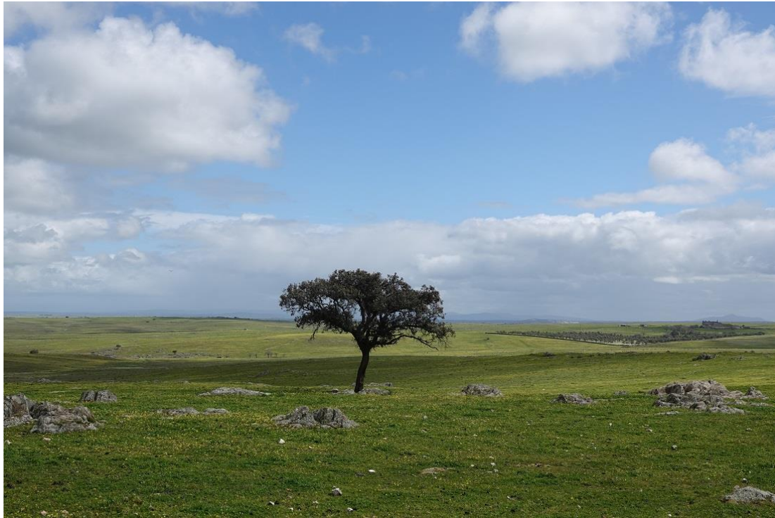
On the plains