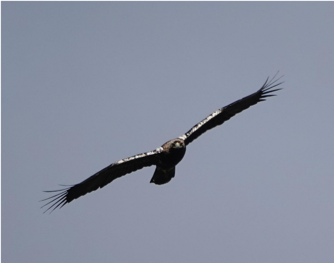
Spanish Imperial Eagle

We stopped overlooking the River Tamuja for our picnic. It was a very attractive stop, despite the fresh wind. We enjoyed a good view of a Short-toed Eagle quite quickly and then during our stay, had a superb sighting of a Spanish Imperial Eagle . A female Sparrowhawk caused alarm amongst the Barn Swallows .