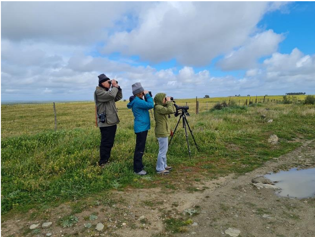
Looking for Ulrike's bird

Sunshine and showers with a fresh wind summed up the weather today, so it felt often quite chilly during our stops on the open plains. We headed west from Trujillo, entering the vast plains, looking stunning with the yellow mantle of Tall Rocket in flower. At our first stop we saw a group of Great Bustards which included a male in full display. We had much more distant views of a small group of Little Bustards . A large flock of Pin-tailed Sandgrouse also erupted from the same field, and we obtained subsequently some excellent views of two at quite close range. Calandra Larks sang from all sides. Taking a small dirt track, we stood, surrounded by the plains, watching a distant Spanish Imperial Eagle , as well as smaller birds such as Northern Lapwing , Crested Larks and Lesser Kestrel .