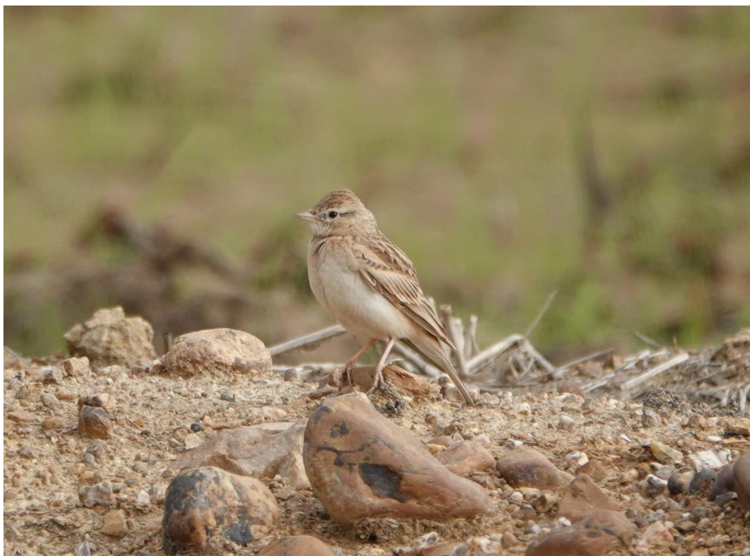
Greater Short-toed Lark

We continued through some rice fields and stopped beside the dam of the Sierra Brava reservoir just as two Great Spotted Cuckoos flew over. We then went to the village of Vegas Altas where we had an excellent coffee break at a friendly small bar. We then drove around rice fields behind the village, finding some very smart Iberian Yellow Wagtails and numerous Stonechats , as well as Greater Short-toed Larks .