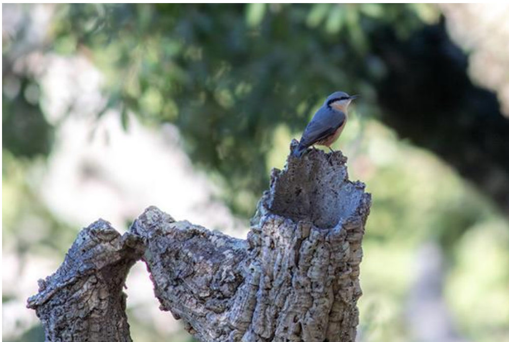
Eurasian Nuthatch (Becke Sigaty)

We moved back northwards, stopping on the plains near Campo Lugar to be rewarded with fine views of Little Owl and of a male Hen Harrier mobbing a female Western Marsh Harrier . Calandra Larks sang around us. It was then a drive to the western flank of the Villuercas Mountains, where we stopped in an area of cork oak woodland. Eurasian Nuthatches were calling around us and we must have seen at least six. A single Firecrest was also seen. We paid a visit to the village of Cabañas del Castillo where a short walk took us to a place where we could look into the valley to the east, set between spectacular rocky ridges where Griffon Vultures soared and a Peregrine was watched attempting to hunt Crag Martins . Black Redstarts perched on the rocks beside us. At the gorge through which cut the River Almonte, we saw two Roe Deer .