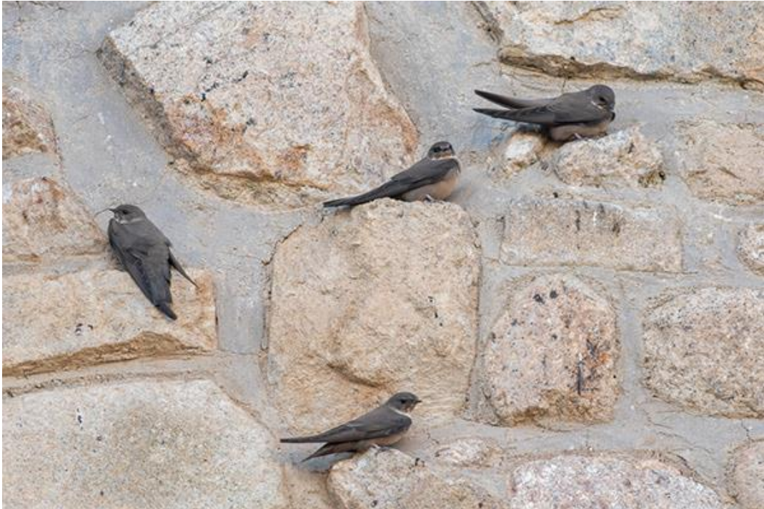
Eurasian Crag Martin (Becke Sigaty)

We completed the day with a brief visit to the historic main square of Trujillo, where there were flocks of Crag Martins perched on the stone facades of the houses, along with two Red-rumped Swallows .