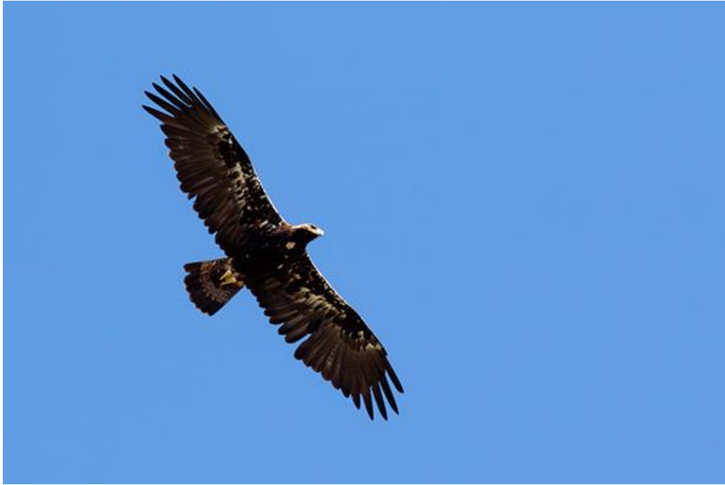
Spanish Eagle (Becke Sigaty)

After coffee, we moved to an area of riparian woodland below the dam of the Guadiloba Reservoir. The place was full of Common Chiffchaffs , amongst which we also found a rare Yellow-browed Warbler . In the same tree a Brambling was perched.