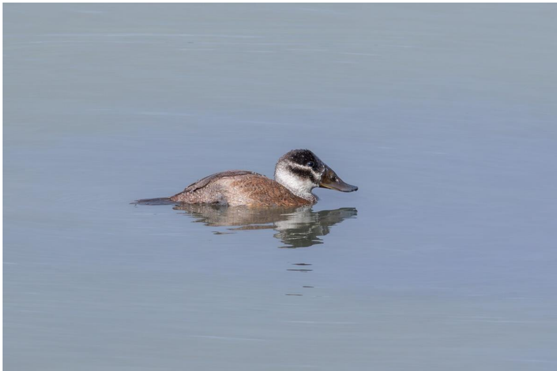
White-headed Duck (Becke Sigaty)