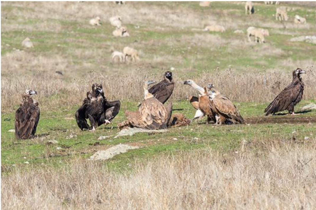
Cinereous and Griffon Vultures (Becke Sigaty)

As we drove across the plains, we had several sightings of both Cinereous and Griffon Vultures on the ground, on one occasion feeding on a carcase.