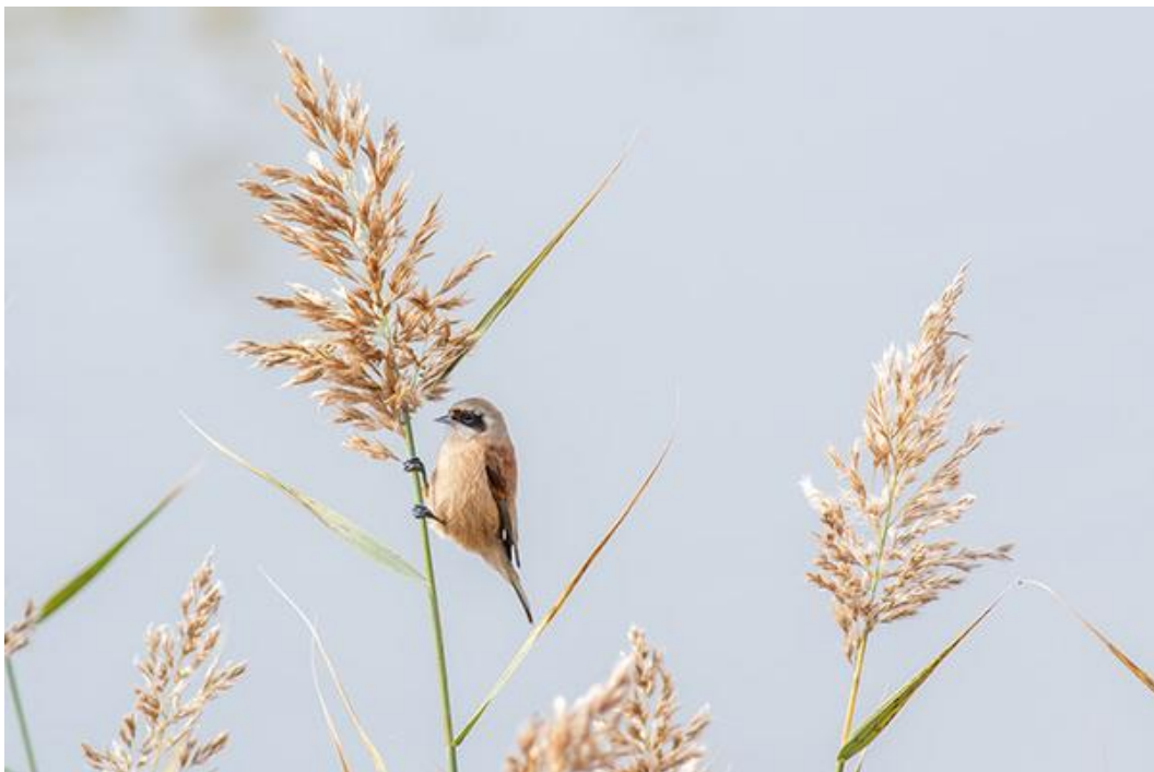
Penduline Tit (Becke Sigaty)

Perhaps 300 Greater Flamingo stood roosting in the centre. Five Western Marsh Harriers flew together over the reeds. Close to the first hide an obliging Penduline Tit came in to forage on a reed stem.