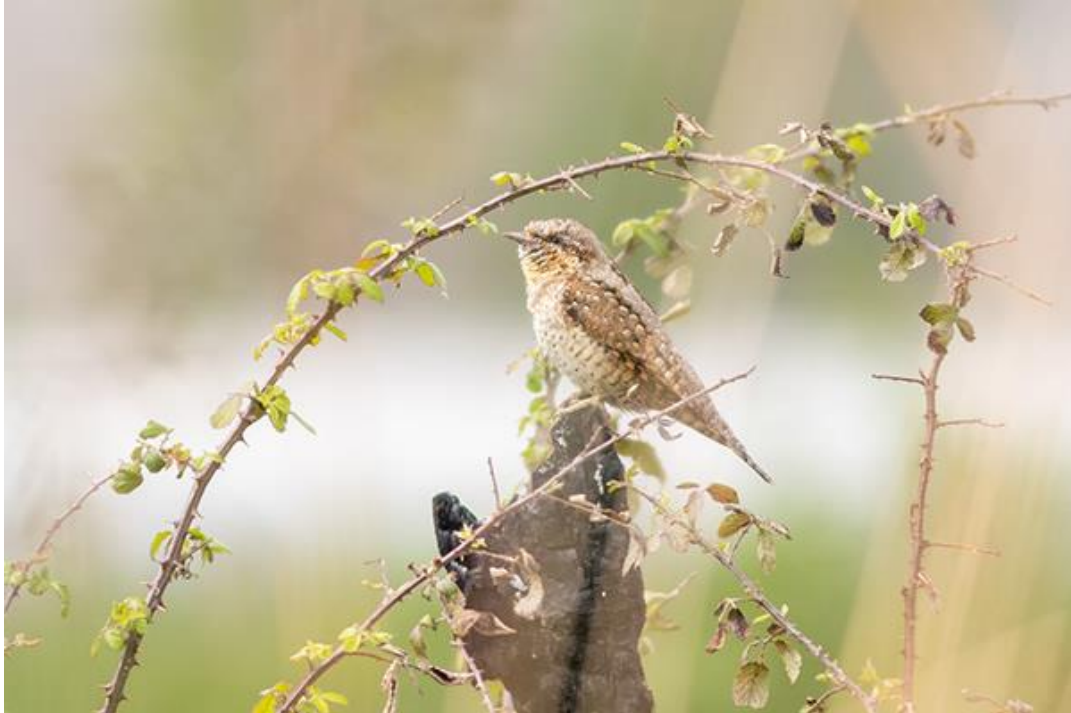
Eurasian Wryneck

On the plains we stopped to admire a Little Owl and just a little to the south we had good views of several Great Bustards in flight, along with our first Common Cranes of the day. Continuing beyond the town of Madrigalejo, we did a circuit through arable land (rice, corn and fruit trees) where several hundred Common Crane were feeding. We had good views of Spanish Sparrow . We also checked some sites just north of the town, seeing a roosting flock of about 50 Stone Curlew , as well as Iberian Grey Shrike .