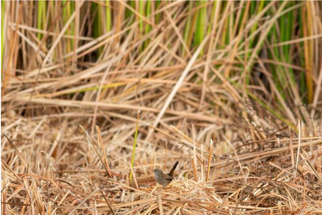
Cetti's Warbler (Becke Sigaty)

We drove north-east to the reservoir of Arrocampo, beside the village of Saucedilla. We spent a few minutes waiting for the information office to open, standing close to a section of the marsh where Barn Swallows were feeding. We heard two Little Bitterns . Once we had obtained a hide key, we moved to a hide overlooking a section of the marsh and spent an amazing 90 minutes with a procession of birds appearing in front of us. First were great views of Cetti's Warblers and Common Chiffchaffs , then a male Bluethroat made several appearances and sang from the reeds in front of us.