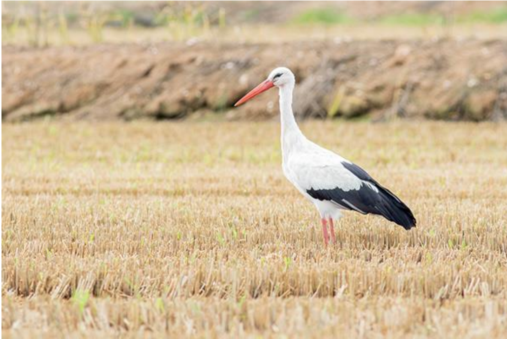
White Stork (Becke Sigaty)