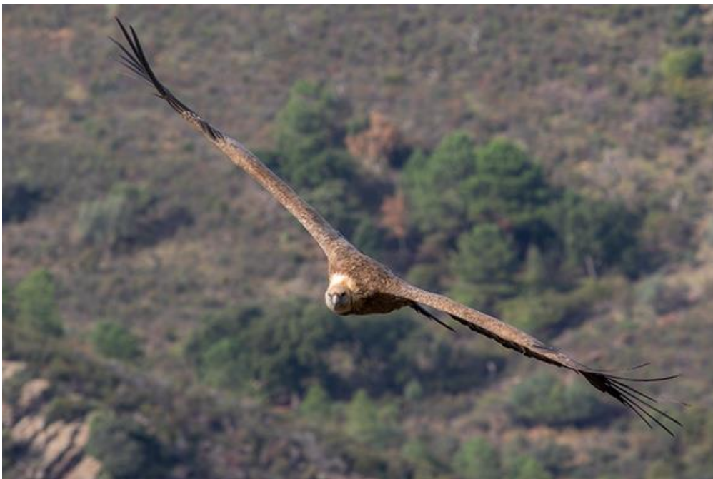
Griffon Vulture

Onward to the Monfragüe National Park, to have our picnic at the Portilla del Tiétar, where a pair of Spanish Imperial Eagles soared amongst Griffon and Cinereous Vultures .