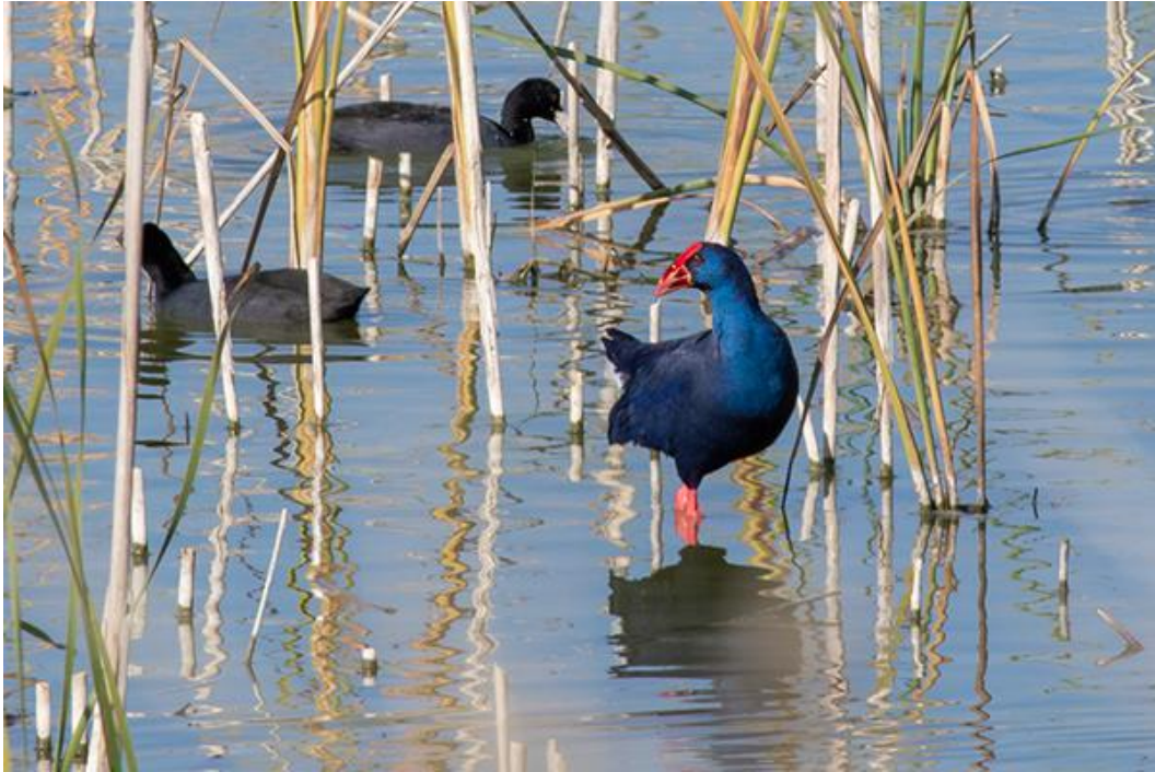
Western Swamphehen (Becke Sigaty)

Perhaps 300 Greater Flamingo stood roosting in the centre. Five Western Marsh Harriers flew together over the reeds. Close to the first hide an obliging Penduline Tit came in to forage on a reed stem.