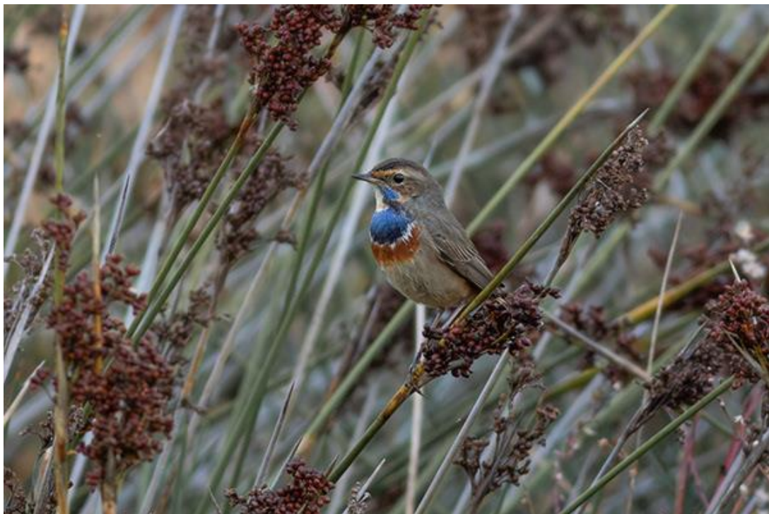
Bluethroat (Becke Sigaty)

We drove north-east to the reservoir of Arrocampo, beside the village of Saucedilla. We spent a few minutes waiting for the information office to open, standing close to a section of the marsh where Barn Swallows were feeding. We heard two Little Bitterns . Once we had obtained a hide key, we moved to a hide overlooking a section of the marsh and spent an amazing 90 minutes with a procession of birds appearing in front of us. First were great views of Cetti's Warblers and Common Chiffchaffs , then a male Bluethroat made several appearances and sang from the reeds in front of us.