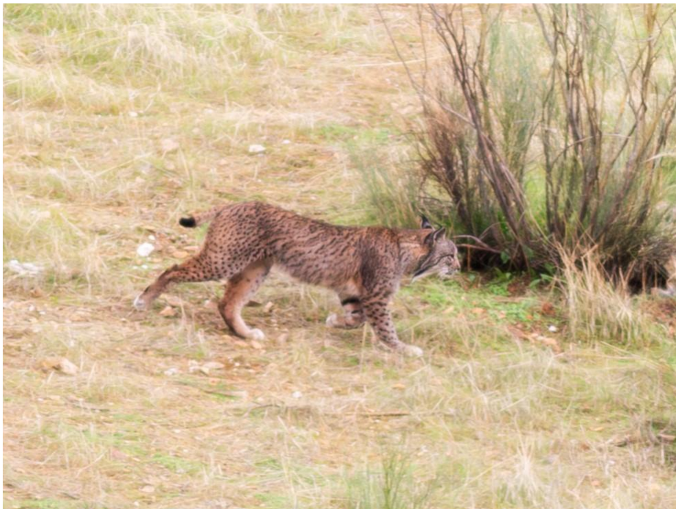
Iberian Lynx (Becke Sigaty)

Suddenly we spotted an Iberian Lynx jump over a stone wall and then make its way across a field, as the rabbits scattered. It was a wonderful view of this rare endemic mammal.