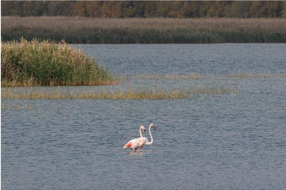
Greater Flamingo (Becke Sigaty)