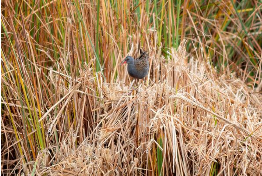
Water Rail

Incredibly, a Water Rail came right out into the open and stood on top of cut reed mace. To crown it all, a male Penduline Tit also flew in for a few minutes in full view.