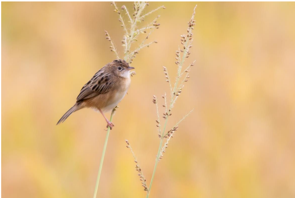
Zitting Cisticola (Becke Sigaty)

There had not been much rain overnight, but the forecast was for some more during the day. We set off after breakfast southwards, passing through the town of Zorita where we stopped to refuel. As we entered the plains south of the town, the clouds were heavy and dark, but apart from some light and occasional showers of rain, we managed to stay dry all day.