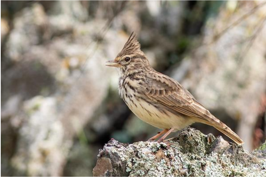
Thekla's Lark (Becke Sigaty)

Suddenly we spotted an Iberian Lynx jump over a stone wall and then make its way across a field, as the rabbits scattered. It was a wonderful view of this rare endemic mammal.