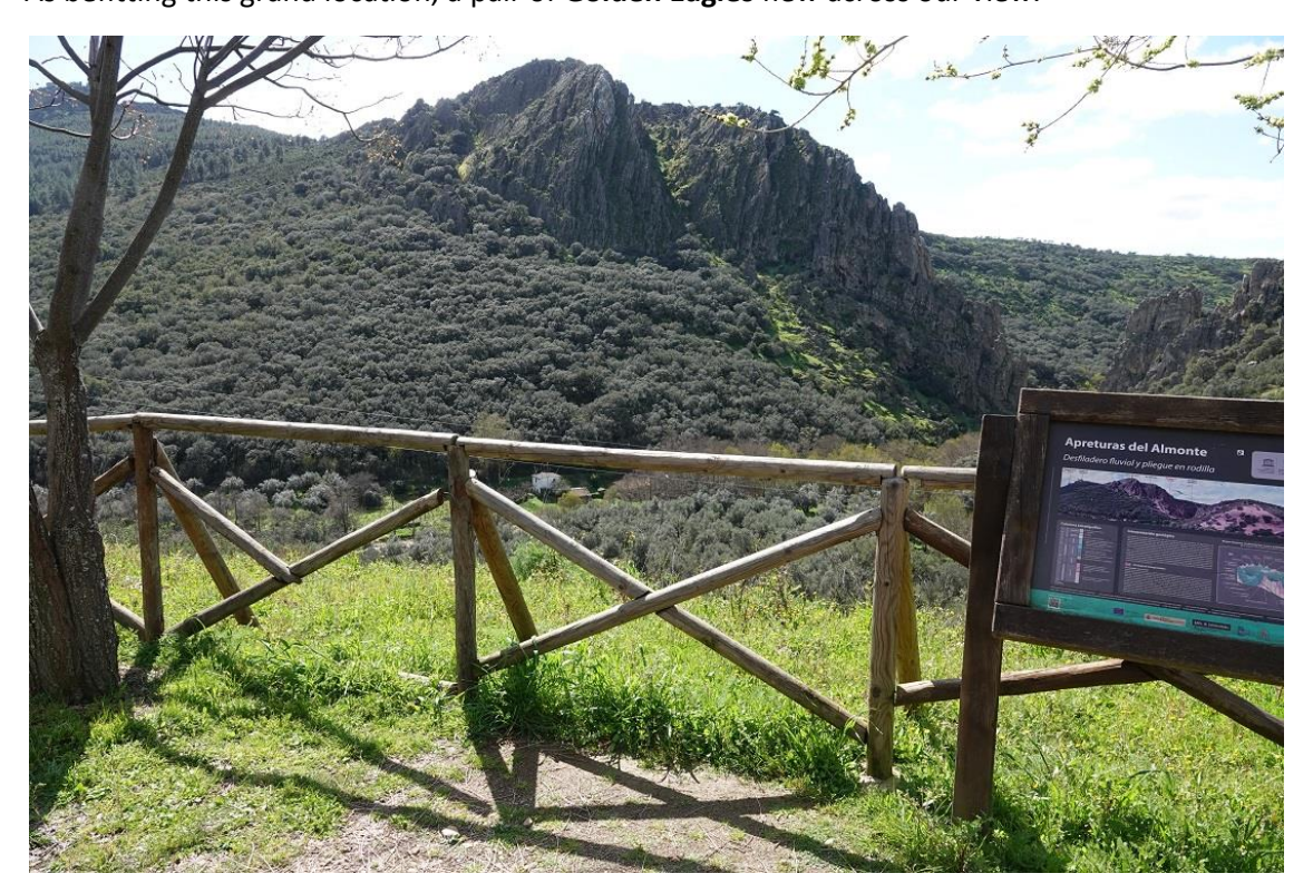
Our picnic site with a view

As befitting this grand location, a pair of Golden Eagles flew across our view.