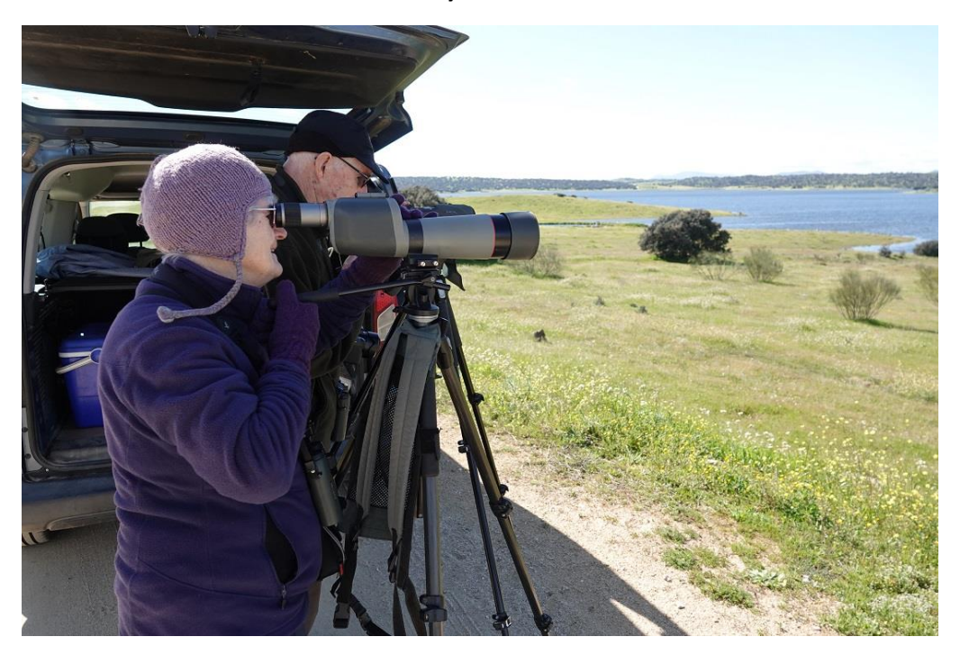
Watching the Blue-winged Teal and Garganey at Alcollarín