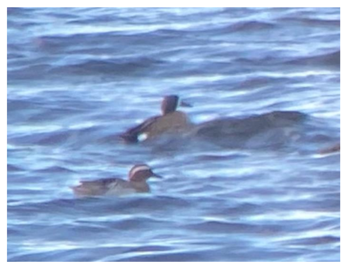
Blue-winged Teal and Garganey

Following coffee at Campo Lugar, we spent the rest of the day at the nearby Alcollarín Reservoir. It was rather choppy so the multitude of duck present were not easy to study. However, close to where we had our picnic, we found a couple of male Garganey amongst the Teal and then, to our surprise and delight, a male Blue-winged Teal !