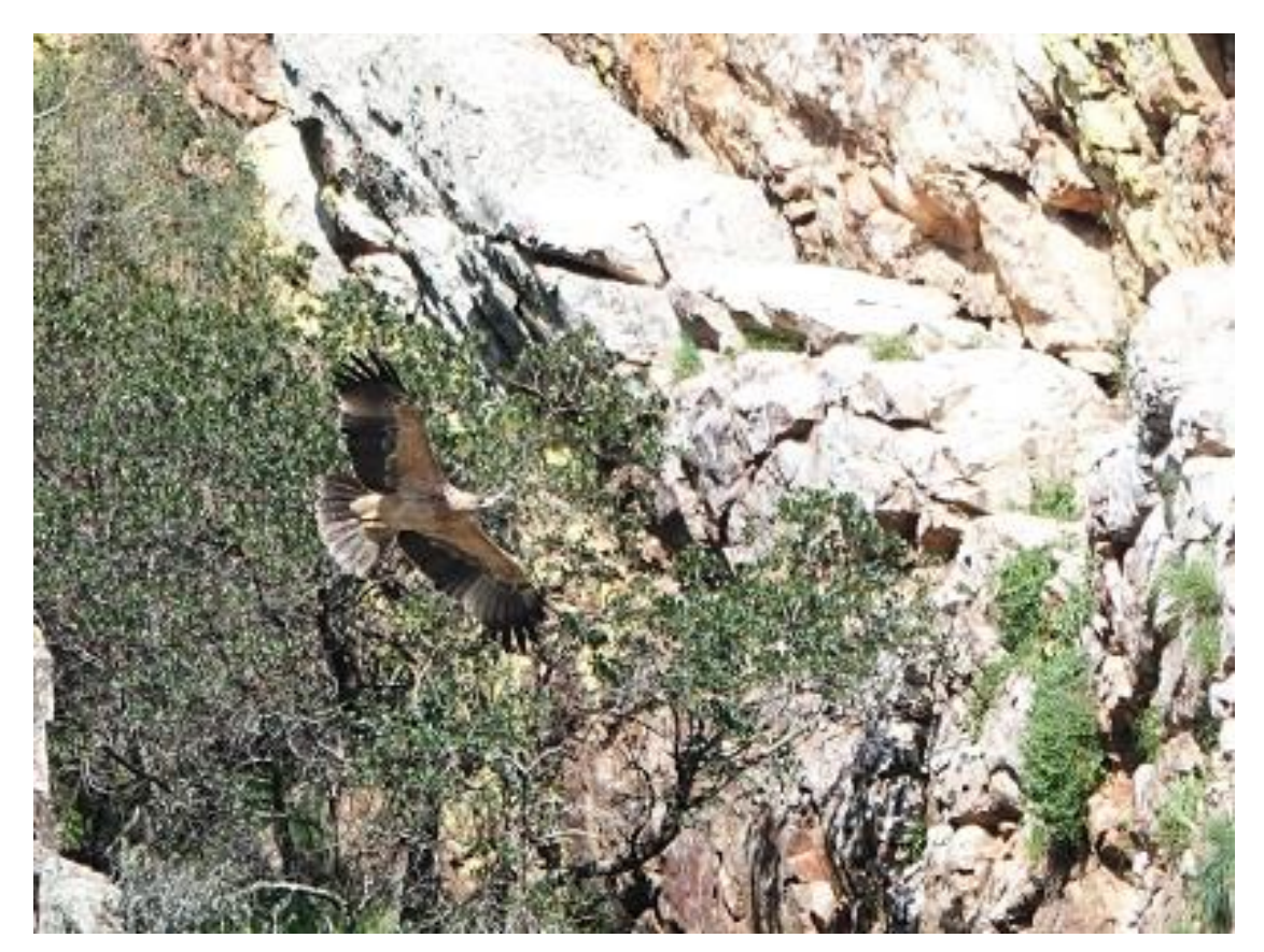
Juvenile Spanish Imperial Eagle