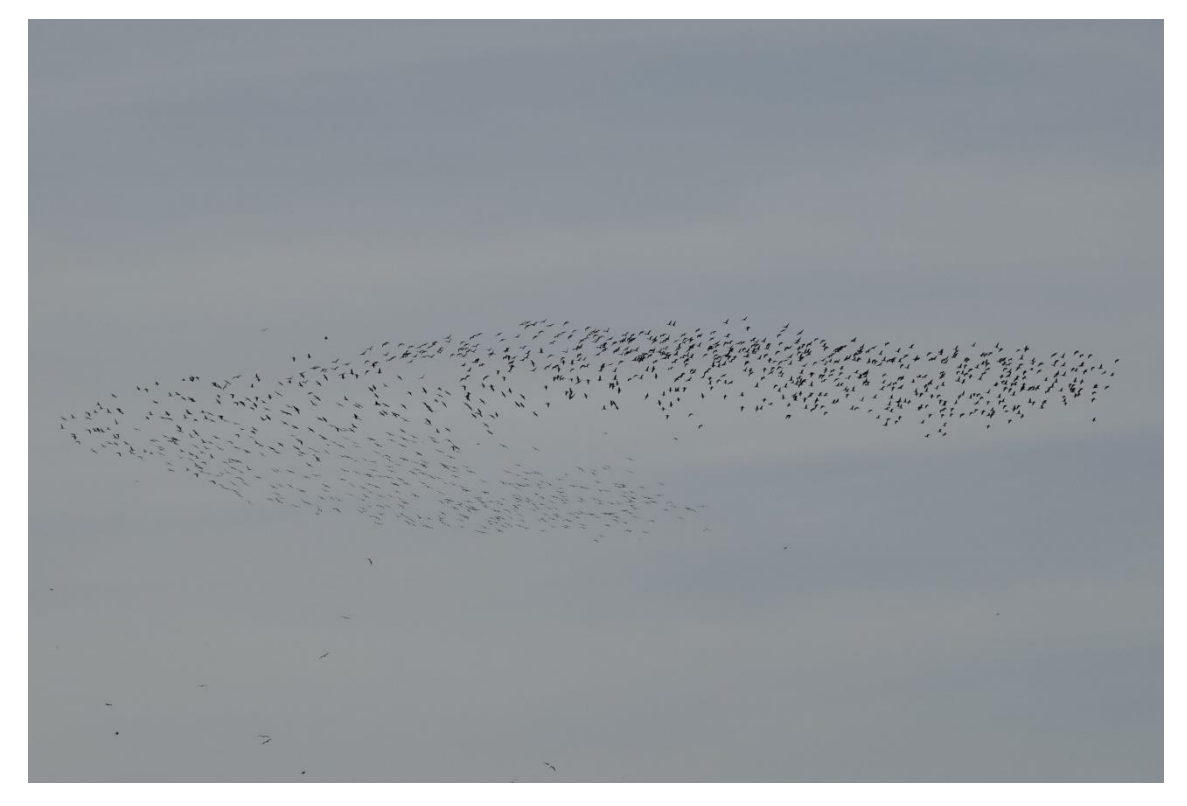
Vast flock of Glossy Ibis

The rest of the day was devoted to the rice fields. At one stop there were huge numbers of Black-headed Gulls , a very obliging Water Pipit and flocks of Greenshank . A group of Yellow Wagtails were a real treat. A male Hen Harrier spectacularly flushed a big flock of Common Snipe from the stubble fields. We saw from a distance a swirling huge flock of dark birds high in the sky. Scrutiny revealed them to be Glossy Ibis . As they created formations in the sky, parties dropped like stones and then swirled close to the ground before landing. Luckily we could approach them and we watched them in perfect light. There were perhaps 1300 present, a truly vast flock.