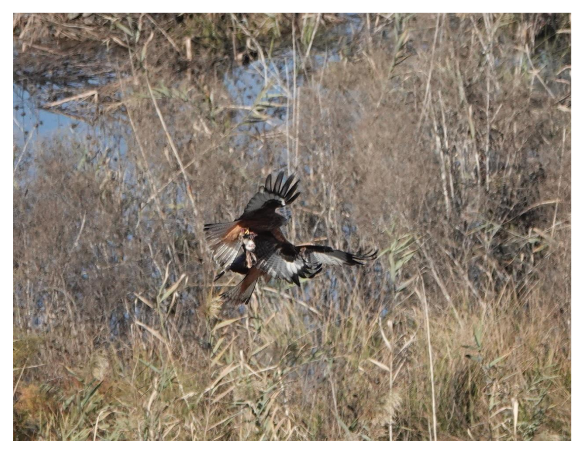
Red Kites fighting over food

We then moved to the spend the rest of the day at the viewpoint of the Chozas de Llera, by which time the fog had cleared and we enjoyed largely clear skies. Although we failed in our objective of seeing Iberian Lynx, we had an extremely productive afternoon, with at least five Spanish Imperial Eagles , including a sky-dancing pair and interactions between adults and a juvenile. There was a very beautiful immature Golden Eagle and Red Kites were also magnificent.