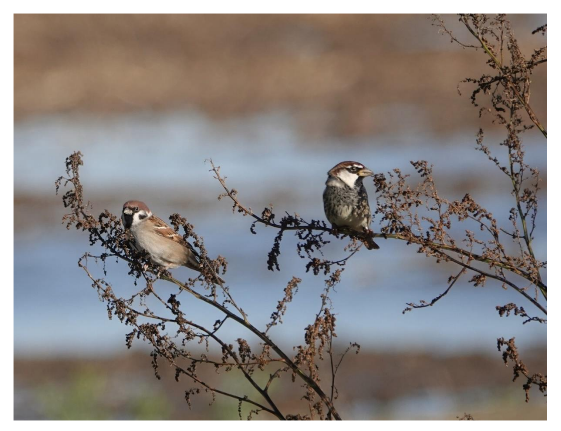
Tree and Spanish Sparrows

Here we spent a very fulfilling afternoon, enjoying perhaps over ten thousand Common Cranes and also large flocks of waders, including some beautiful Kentish Plovers (about 165 birds), Little Stints , Spotted Redshank , as well as Hen Harriers , Marsh Harriers and small birds like Water Pipits .