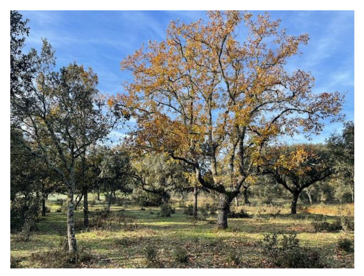
Mixed oak dehesa woodland

It was a perfect day to ascend to the forests near Garciáz. The sky was clear and there was no wind. We started with a short walk at the Cordel de Madrigalejo, though mixed holm and Pyrenean oak woodland.