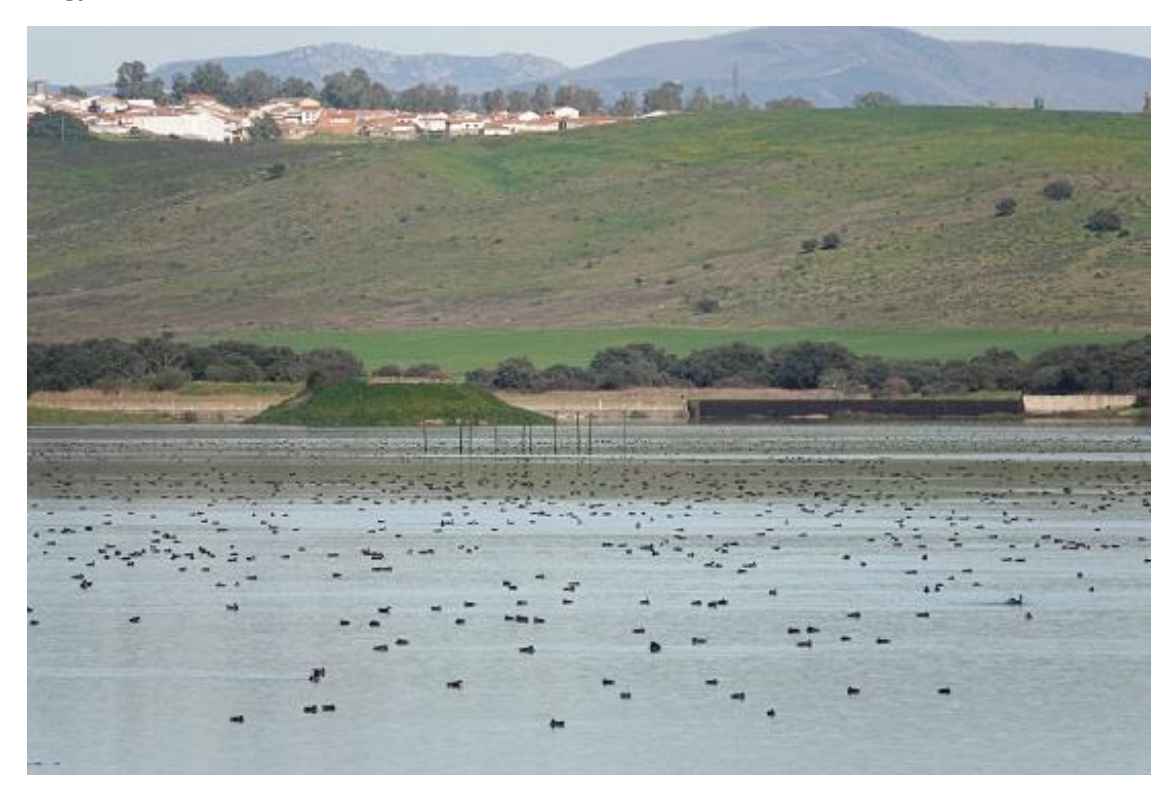
A fraction of the thousands of ducks at Alcollarín

We explored part of the eastern shore and western shore of the reservoir. As well as the variety of duck, there were three species of grebe present: Great Crested , Little and Blacknecked (the latter with ember-red eyes), Spoonbill , Marsh Harriers and parties of Iberian Magpies .