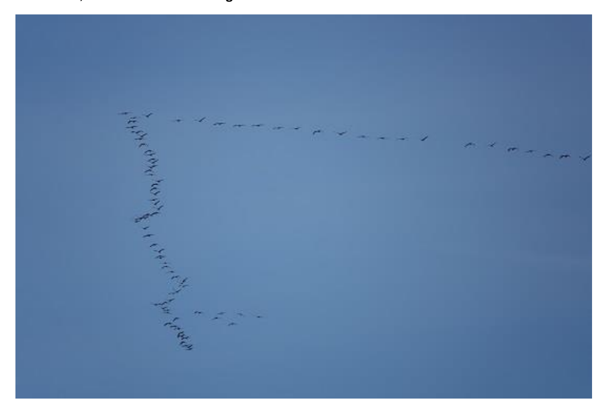
Migrating Common Cranes

Continuing along the road, we had lovely views of a newly arrived Lesser Kestrel and from a small track, we saw Pin-tailed Sandgrouse and Golden Plover .