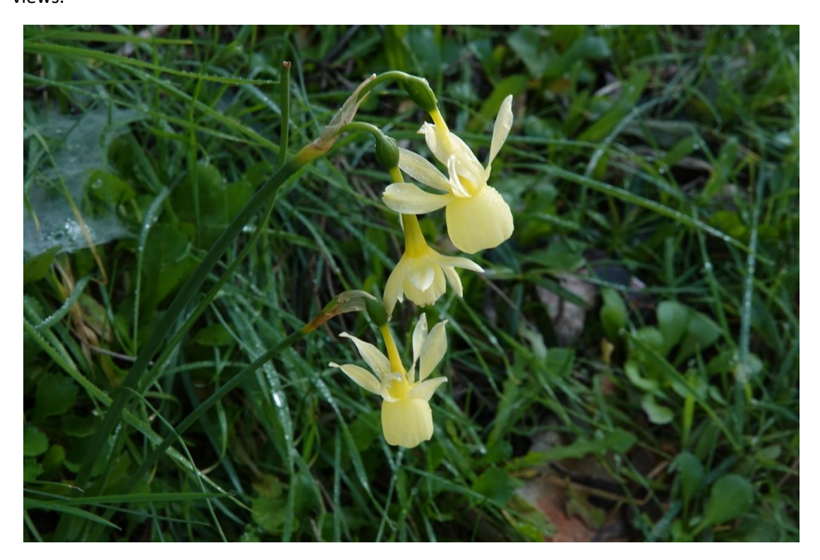
Angel's Tears Narcissus

We drove through the park and had our picnic in a belt of elms overlooking the Tiétar River, as Black and Griffon Vultures soared overhead. A pair of Bonelli's Eagles afforded us excellent views.