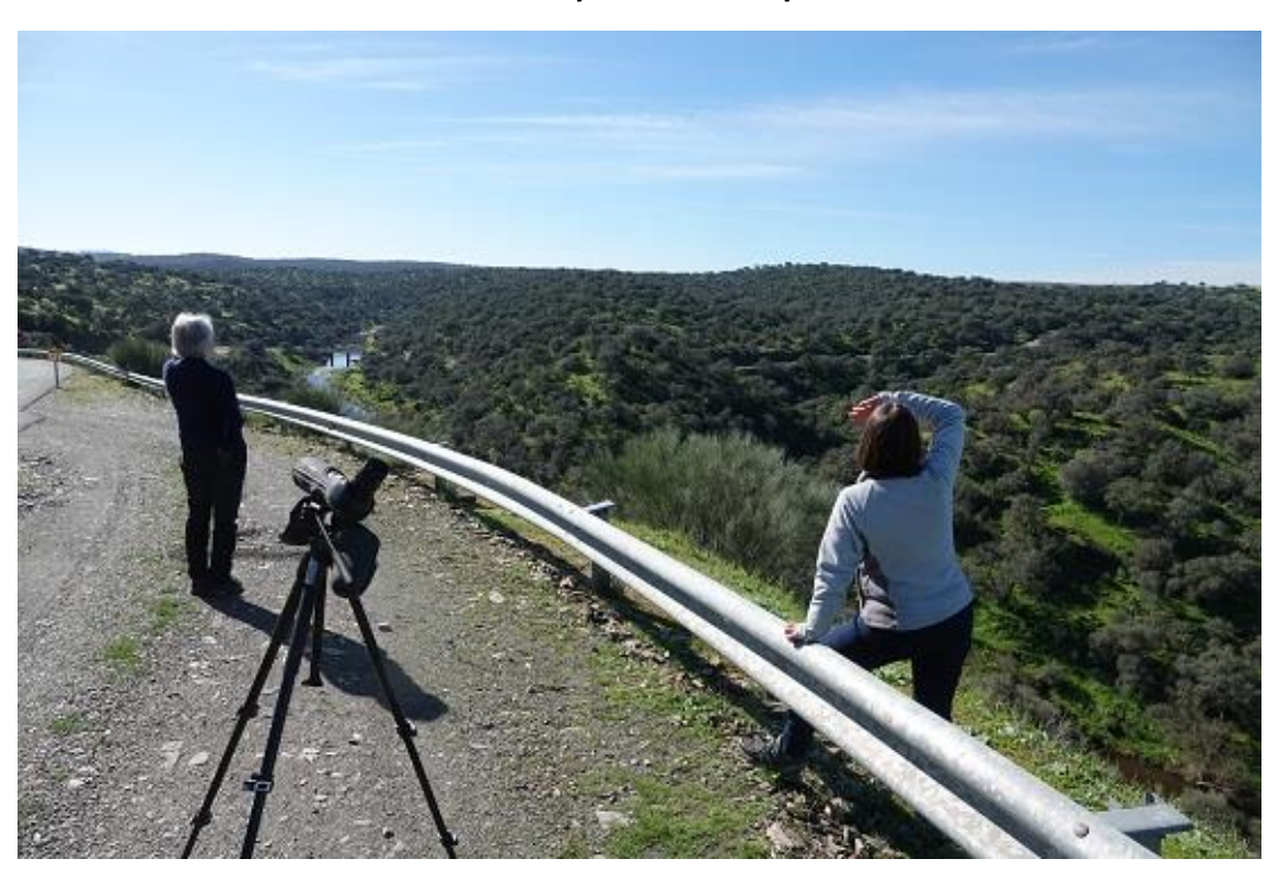
Watching migrating Common Cranes