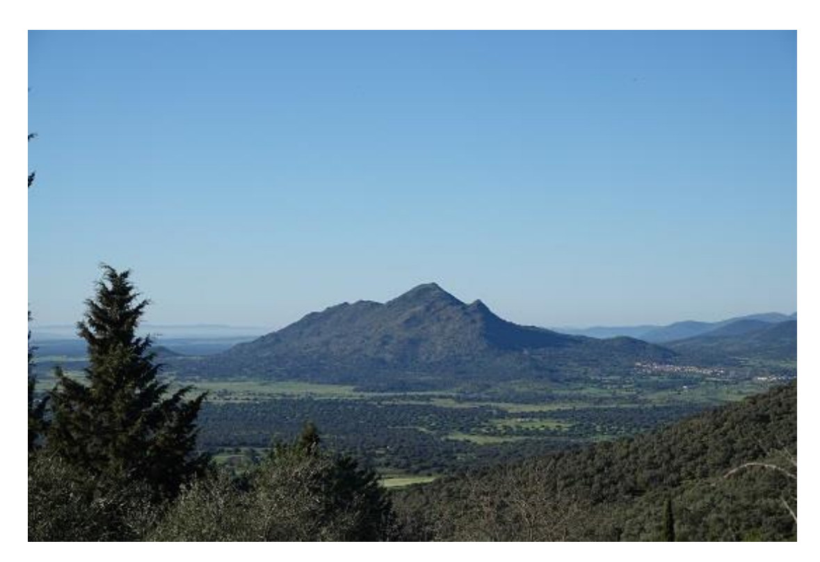
View of San Gregorio from Sierra de los Lagares

The flora was magnificent with Sage-leaved Cistus, Iberian Milk-vetch, Dwarf Pansy and Hoop Petticoat Narcissus in flower. We also saw a few butterflies such as Western Dappled White, Queen of Spain Fritillary and Wall Brown. It was also a time to ponder on the story behind the derelict buildings that we passed and see how some had been brought back to dwellings, some very swanky indeed.