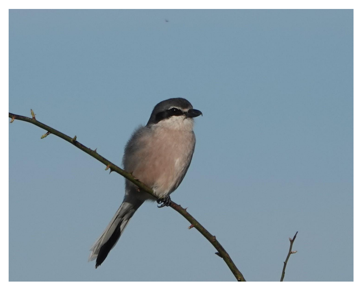
Iberian Grey Shrike