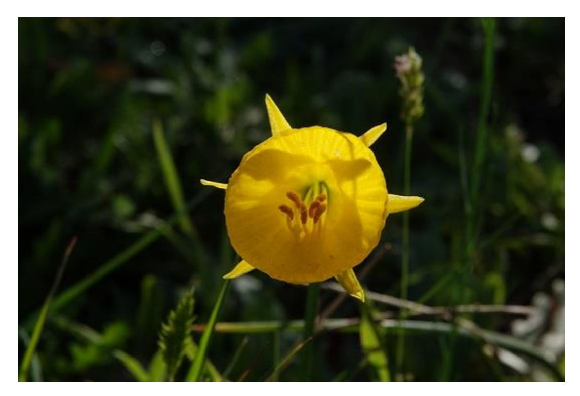
Hoop Petticoat Narcissus