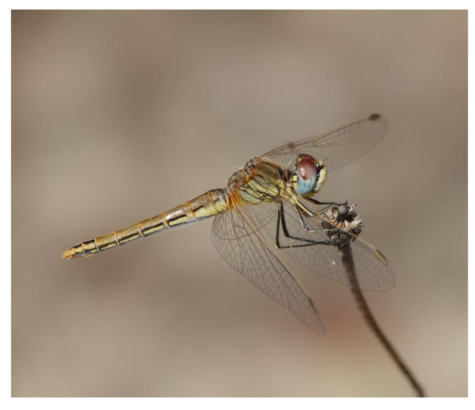
Female Red-veined Darter

After coffee in Campo Lugar we headed to the village of Alcollarín. We stopped beside the river, having lovely views of a group of Common Waxbill and found a superb Stripeless Tree Frog , as well as shield bugs on Thorn Apple which grew profusely there. A dark-phase Booted Eagle soared overhead. We moved then to the Alcollarín Reservoir, stopping for our picnic in a belt of holm oak. Here there were several African Grass Blue butterflies, tiny butterflies taking advantage of the first of the afternoon sunshine. Red-veined and Common Darters , as well as a Migrant Hawker were present too.