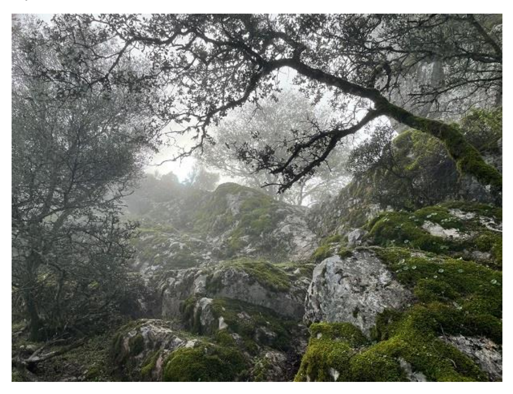
Mist near Monfragüe Castle

A clear and sunny morning as we crossed an almost endless landscape of dehesa north of Trujillo, but as we approached the southern ridge of the Monfragüe National Park, we could see fog curling downwards over the slope of the ridge. We parked on the side of the ridge below the castle and walked through the enchanting misty and mossy trees which grew from the fissures in the rocky outcrops. It was magical. At the castle, there were gaps in the mist, enabling us to look down on the canopy of holm oak, cork oak and wild olives on the southern side of the ridge. Most of the birds recorded were heard rather than seen: Short-toed Treecreeper, Black Redstart and Chaffinches .