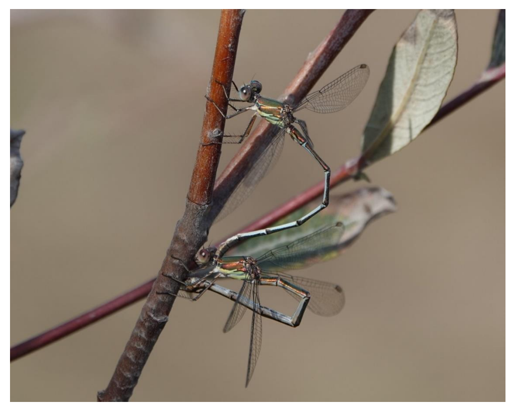
Western Willow Spreadwing

We spent an extremely productive afternoon beside some pools to the east of the town. Here we found no fewer than nine species of dragonfly, including three species of spreadwing. Several species, such as Small Spreadwing , Lesser Emperor and Red-veined Darter were busy ovipositing. A party of White Stork circled overhead, and a small group of Common Cranes passed close to them. The reptiles present were fascinating: Geniez's Wall Lizard and, most exciting, two Spiny-footed Lizards .