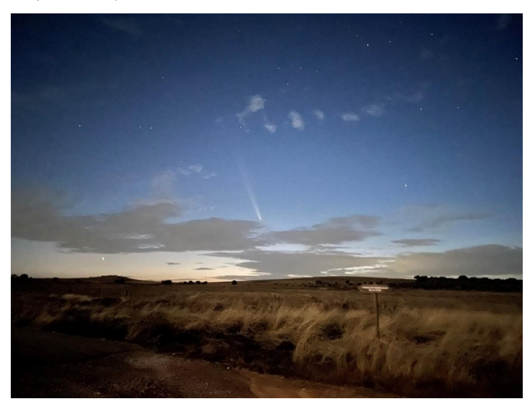
Comet C/2023 A3 Tsuchinshan-ATLAS

After lunch at the bar in Saucedilla, we made a short drive to the western side of the reservoir. There were large numbers of Cattle Egrets around a farm pond. It was then time to move on to Trujillo, where a short expedition was done to the supermarket. We reached Casa Rural El Recuerdo just before 5pm.