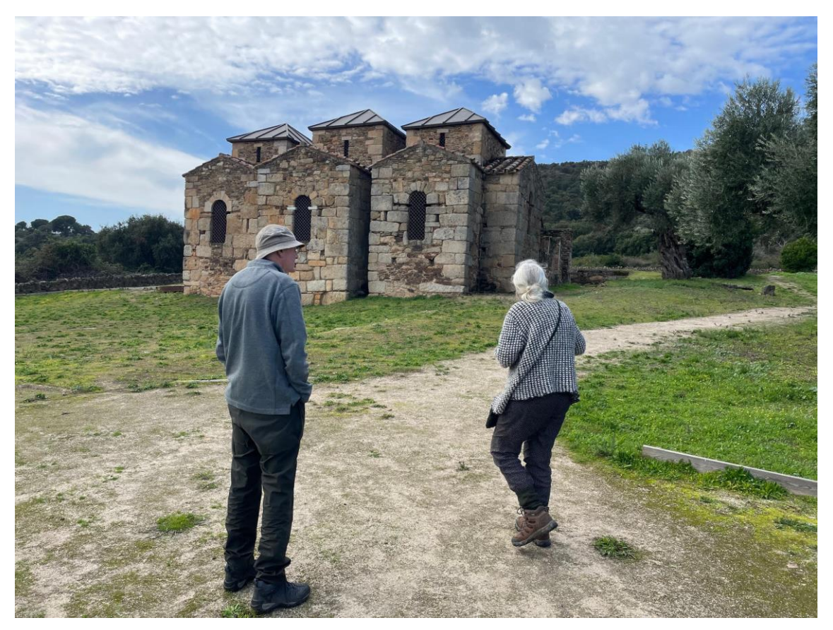
The Visigoth Church at Alcuéscar

Today, on a day that started overcast and with light rain but quickly developed to warm sunshine, we took a circuit of cultures (with some birds thrown in!). We started to the west of Trujillo at the mountain town of Montánchez, to visit the imposing castle that looks over the tightly-knit town. The castle has a Moorish origin and then became strategically important for the Reconquest. The views were outstanding and the information given first rate. We found three Alpine Accentor , the castle being a traditional wintering site for the species. Crag Martins flittered overhead and we also had good views of a Black Redstart . From there we stopped at the next town, Alcuéscar, to visit the Visigoth church of Santa Lucia de Trampal. This is the southernmost of the few remaining Visigoth churches in Spain, set in a beautiful olive grove.