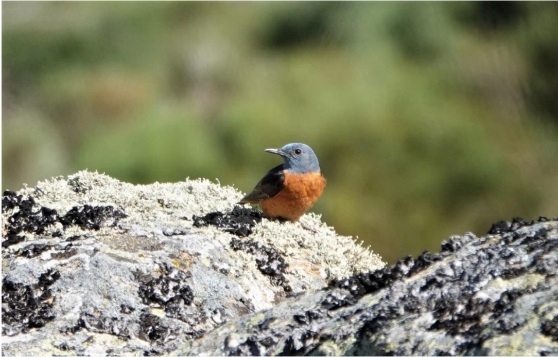
Common Rock Thrush

After coffee in the historic town of Candelario, we made another ascent to a car park high above the town. Here Lesser Kestrels hovered, Quail called and Rock Buntings were present, we had our picnic here, again with the sound of Skylarks above us. Stops for butterflies on the descent to a dehesa area yielded an amazing density of Large Tortoiseshells , Brimstones , Provençal Fritillary and a Guadarrama Wall Lizard .