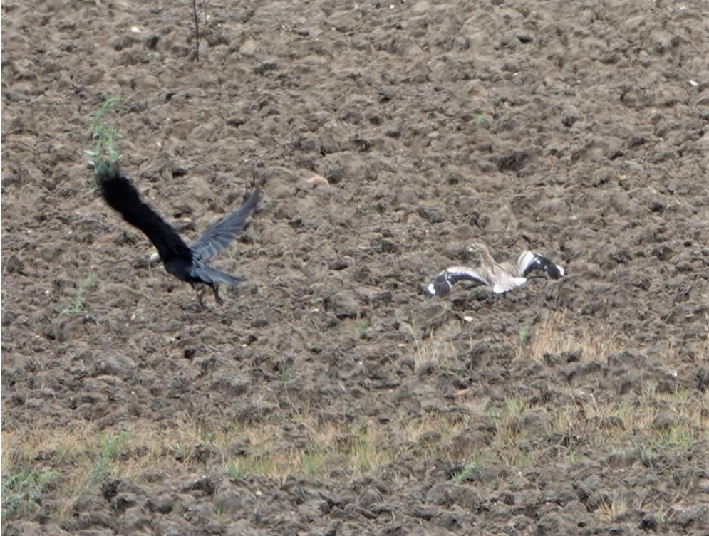
Raven taking Stone Curlew eggs

We stopped for an excellent coffee and nibbles at the small bar in the village and then drove across the rice fields near Palazuelo, seeing a Yellow-crowned Bishop in full breeding plumage, as well as more Iberian Yellow Wagtails .