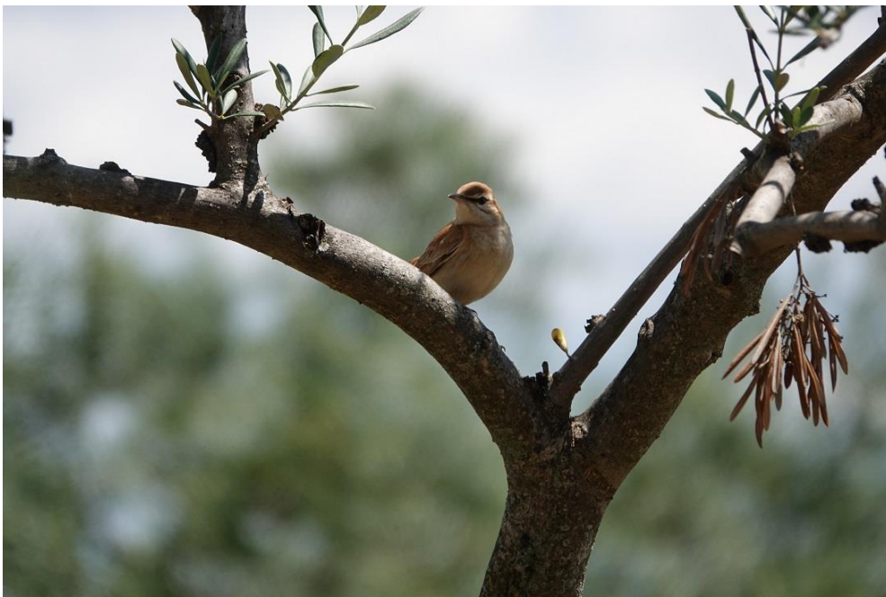
Rufous Bush Robin

It was a mostly sunny day, although we did hit a heavy shower late morning. We visited the olive-growing area near Montehermoso, where we sought the Rufous Bush Robin . After a couple of hours searching we failed to locate any, although we did get great views of Black-eared Wheatear , Thekla Larks , two Short-toed Eagles amongst others. After coffee, we returned to the area, in the sunshine following the shower, and found a singing male that we were able to watch for a long time.