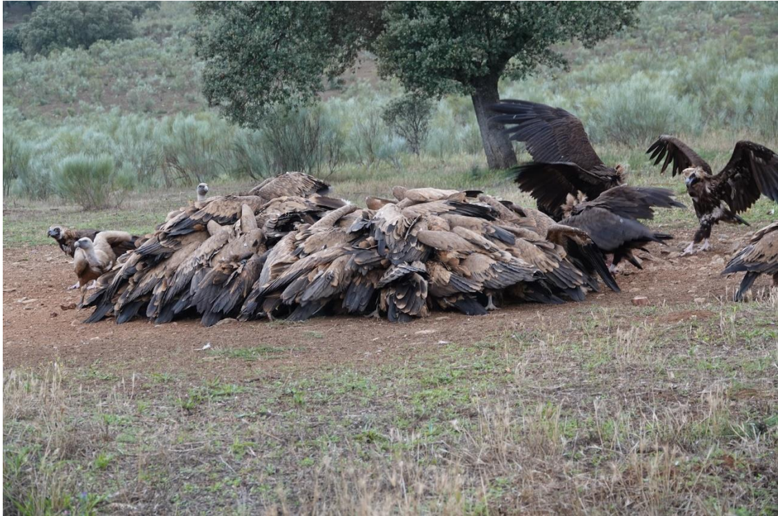
Griffon Vulture scrum with Black Vulture onlookers

We also had a nice view of a soaring Golden Eagle , which looked as if it might have been interested in coming down too.