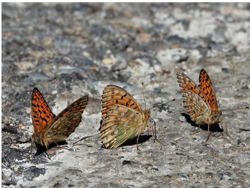
Dark Green with two Niobe Fritillaries

We completed the afternoon on the Hervas road, where again there were large numbers of butterflies feeding on the ground. Most impressively was the diversity coming to a single square metre of filled-in pothole: Peacock , Red Admiral , Southern White Admiral , Nettle Tree Butterfly , Heath , Niobe and Dark Green Fritillaries , as well as Large Tortoiseshell : amazing.