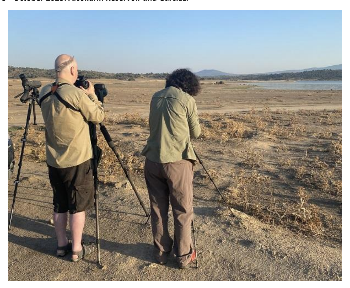
5<sup>th</sup> October 2023: Alcollarín Reservoir and Garciaz.

It was another hot and sunny day and we set off at 08.30 southwards again, stopping this time at the Alcollarín Reservoir, just twenty minutes away. Here we spent the whole morning, first on the western shore. Here we walked a small section of the edge of the reservoir, finding a good selection of waders including Little Stint, Ruff, Spotted Redshank and Kentish Plover. There were several species of dabbling duck present, including newly arrived Wigeon and Pintail. Moving along the eastern shore subsequently we added some more waders, such as Common Redshank, and found a Black Stork. There were large numbers of Great Crested and Little Grebe forming large rafts on the water. A migrant Sedge Warbler was found, as well as a couple of Pied Flycatchers and a Whinchat.