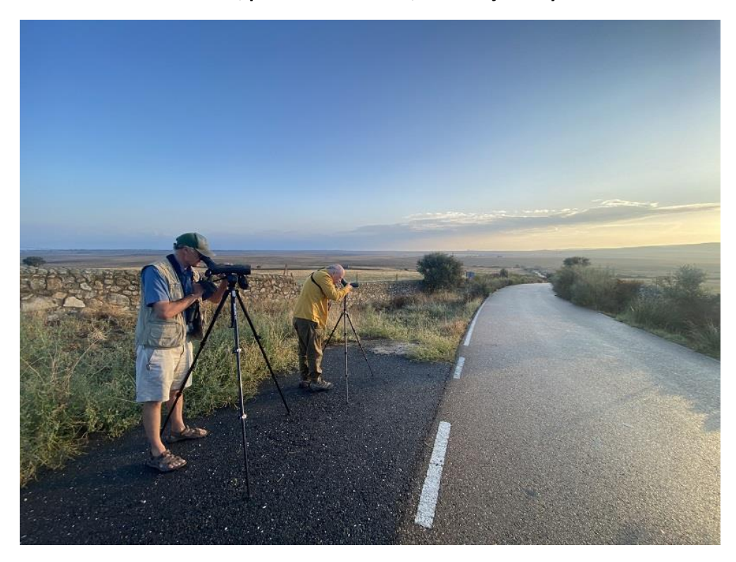
14th October 2023: Belén Plains, pool near Peraleda, onward journey to Madrid

The weather broke during the night, with some heavy rain before dawn. However, we enjoyed fine, albeit a little bit cooler, weather for our final few hours in Extremadura. After bidding farewell to Casa Rural El Recuerdo, we drove east from Trujillo over the Belén Plains. Here we saw a total of nine Great Bustard , a Whinchat as well as the usual great supporting cast of Northern Wheatear , Calandra Larks , some fine Spanish Sparrows , Griffon and Black Vultures on the ground, many Lapwings and Corn Buntings .