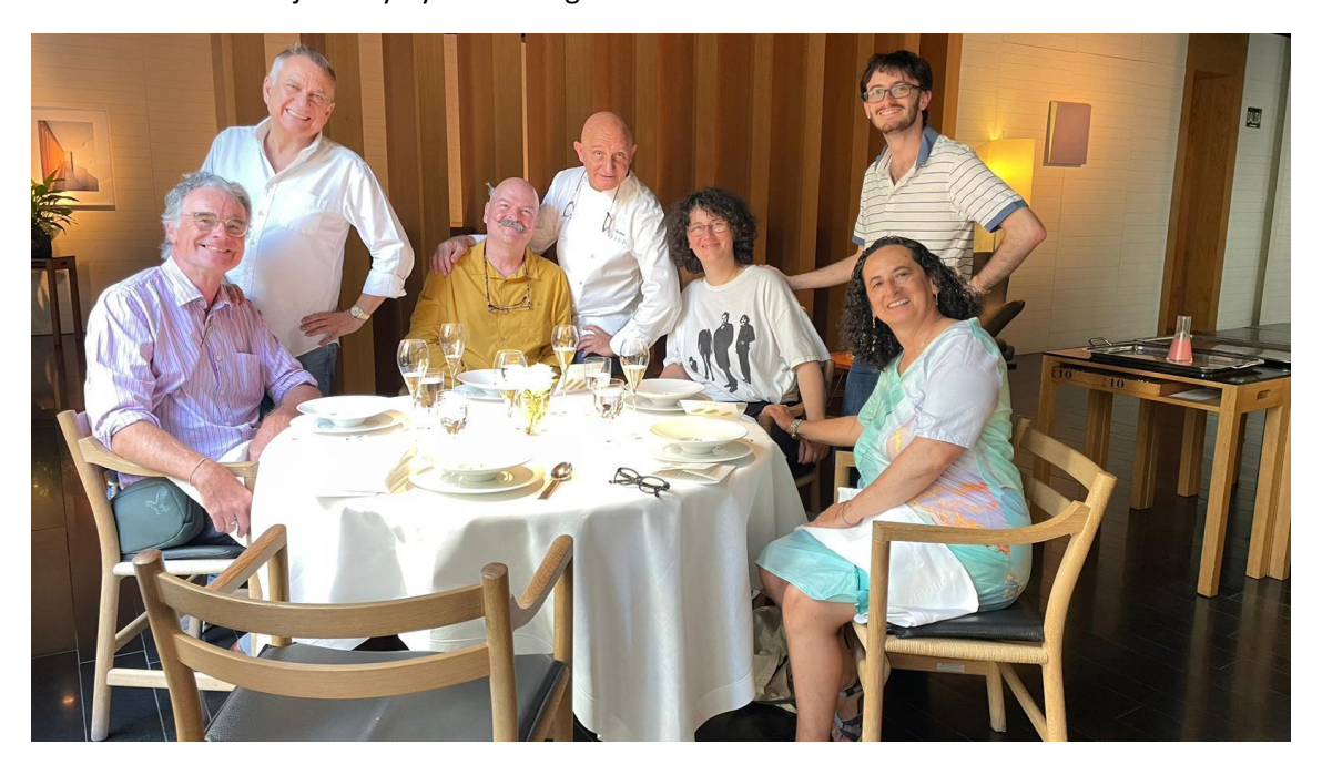
12<sup>th</sup> October 2023: Monfragüe National Park and Pago de San Clemente

A day of culture and fine dining, with a visit to the World Heritage Site of medieval Cáceres, where we spent the morning exploring the historic centre. This included a visit to the exceptionally good municipal museum with a superb collection of artefacts from pre-historic to Visigoth periods. This was followed by the amazing treat of a gourmet lunch with fine wines at the three-Michelin star Atrio restaurant. Starting at 13.30, we finished at 17.30 and had a comfortable return journey by taxi to Pago de San Clemente.