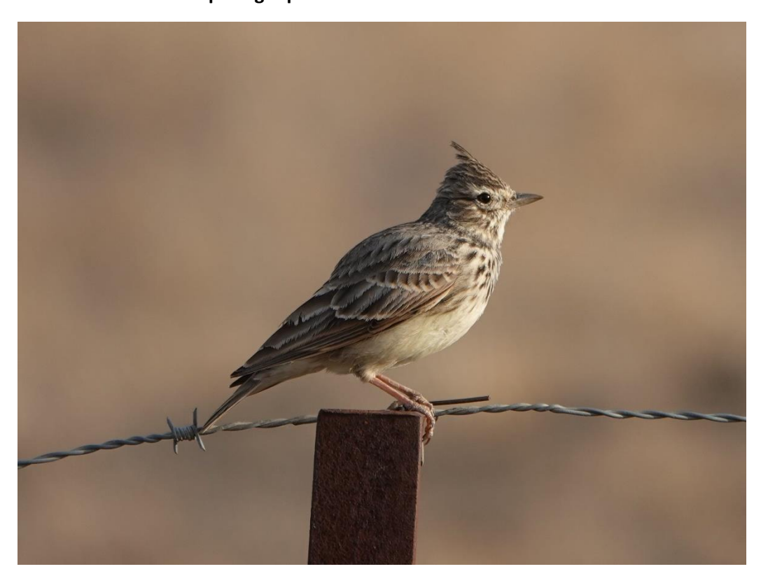
4<sup>th</sup> October 2023: Campo Lugar plains and Palazuelo rice fields.

We set off at 08.30 southwards towards the plains of Campo Lugar. There was a clear sky with all the promise of a hot day to come. At our first stop, there was a light breeze and it was actually very comfortable, with good visibility to scan the plains for birds. We found a few Black-bellied Sandgrouse on the ground (more flying) and started counting the Northern