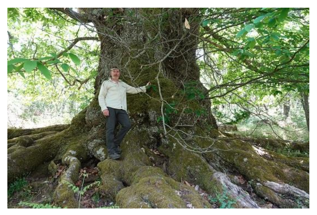
Singular sweet chestnut

At the end of the walked we reached a huge ancient sweet chestnut tree, estimated to be 700 years old.