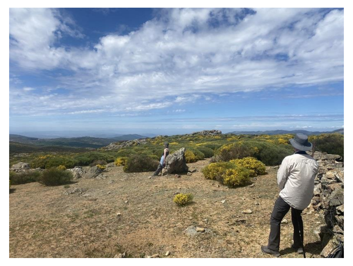
The sound of silence