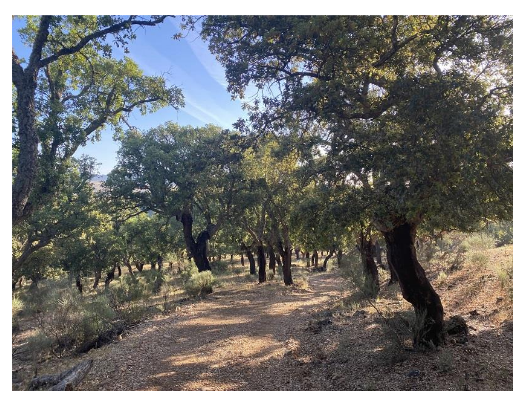
Cork oak grove

Starting closer to home, we had a wonderful morning walking in a cork oak grove north of Jaraicejo. The calm weather, gradually warming up during the day, made it perfect conditions to be in woodland, listening to the sound of birds around us: Nightingales, Short-toed Treecreepers, Turtle Doves, Western Orphean Warblers ....The architecture of the cork oaks, shaped and harvested by generations of people, growing on the gentle hillside, gave one perspective and depth which made the place very special. The trees themselves are superb resources for birds, as befitted the diversity of species we recorded, such as Lesser Spotted Woodpecker, Golden Oriole, Crested Tit and Woodchat Shrike . We watched a delightful Short-toed Treecreeper bringing food to its nest hole in a dead small branch of a cork oak.