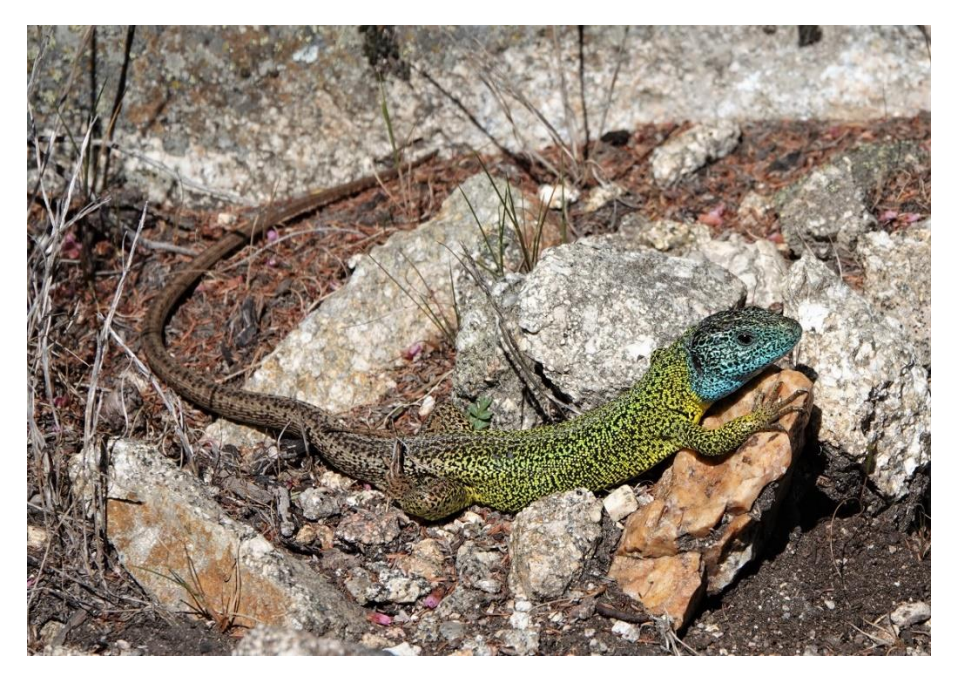
Schrieber's Green Lizard

We encountered three species of lizard including a superb Schrieber's Green Lizard and several Guadarrama Wall Lizards. Queen of Spain Fritillaries were everywhere, but we also found Marsh Fritillary, Knapweed Fritillary and Green Hairstreak.