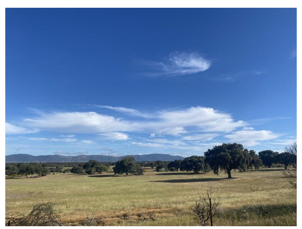
Dehesa near Logrosán

We entered the rice fields area near Madrigalejo where we had a very productive first stop along a road, with fruit orchards on one side and rough pasture with scattered trees on the other. We had superb views of three Black-winged Kites , both perched and in flight. At one time a bird was being mobbed by almost ten Iberian Magpies . We also had superb views of Iberian Grey Shrike . Other species included Little Owl , Hoopoe , Bee-eaters and Sardinian Warbler .