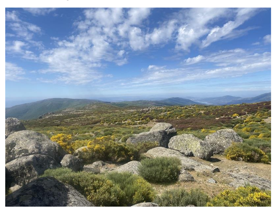
Mountains near Piornal

It was now time to continue northwards, crossing first the floodplain of the Tiétar valley where fields were being planted with peppers and tobacco, then to the town of Jaraiz, centre of the smoked paprika industry. It was surrounded by terraces of cherry trees. We ascended through Pyrenean oak until reaching the broom moorlands above the town of Piornal.