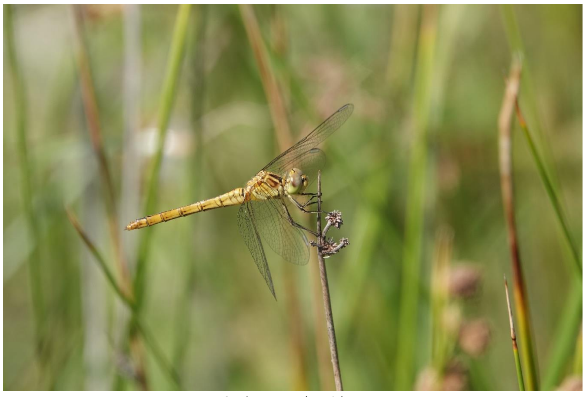
Southern Darter (Martin)

The weather had changed and we enjoyed sunshine and warm to hot temperatures all day. We travelled to the west, stopping first at pools to the east of Malpartida de Cáceres. The conditions were excellent, the pools full of water and straightway we were watching throngs of Small Spreadwings . Gradually other dragonflies appeared, mostly very recently emerged Darters (both Southern and Common ).