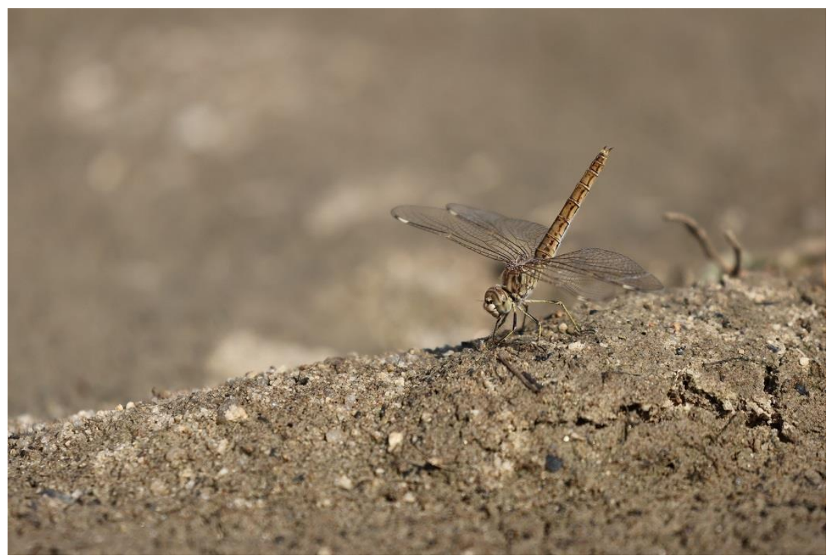
Northern Banded Groundling (Delia)