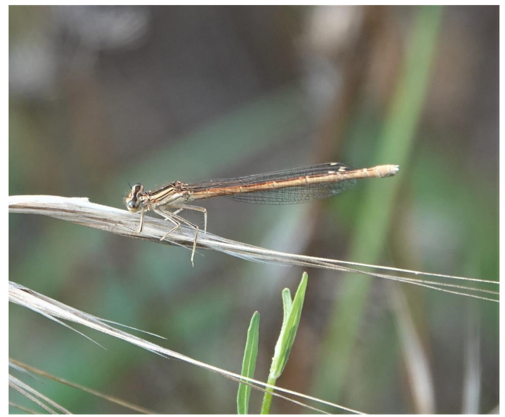
Orange Featherleg (Martin)

We explored the area to the north-east. Stopping first beside the Arroyo de la Vid near Jaraicejo, we almost immediately found one of our sought-after species, an Orange Featherleg . An Iberian Bluetail was also present.