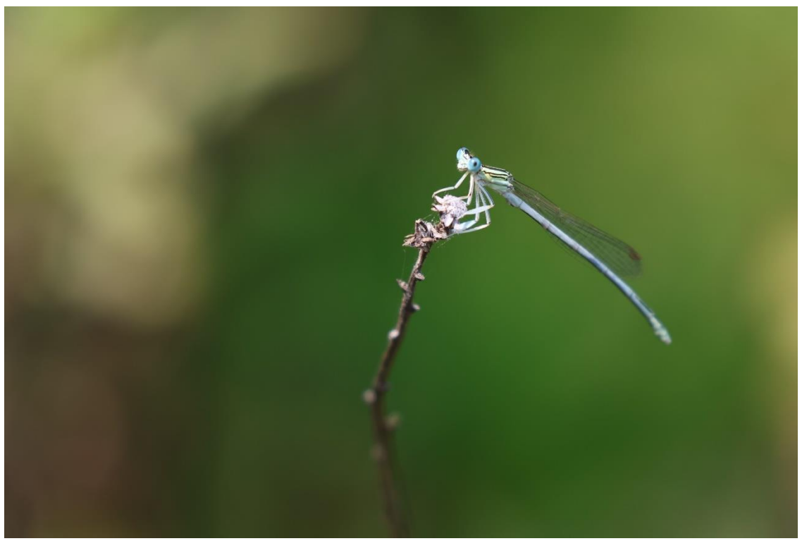
White Featherleg (Delia)

Martin met Delia at Terminal Two, in the early afternoon. We headed off out of Madrid just as the late afternoon traffic was building up. On the open road for Extremadura it was then a very smooth run with hot and sunny weather. We stopped halfway for refreshments, and admired the Barn Swallows nesting under the awnings of the service station. A little further on, once we had entered Extremadura, we made stop near Casatejada, at a small gravel pit. Here we found Violet Dropwing , Broad Scarlet , Iberian Bluetail and numerous White Featherlegs . Birds included a Purple Heron .