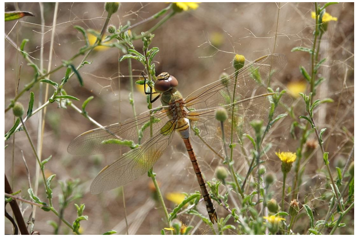
Vagrant Emperor (Martin)