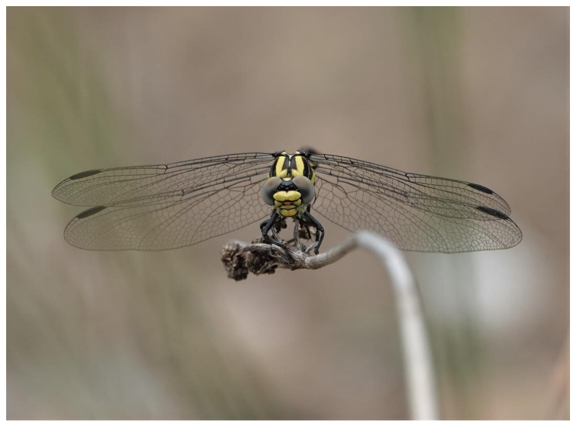
Large Pincertail