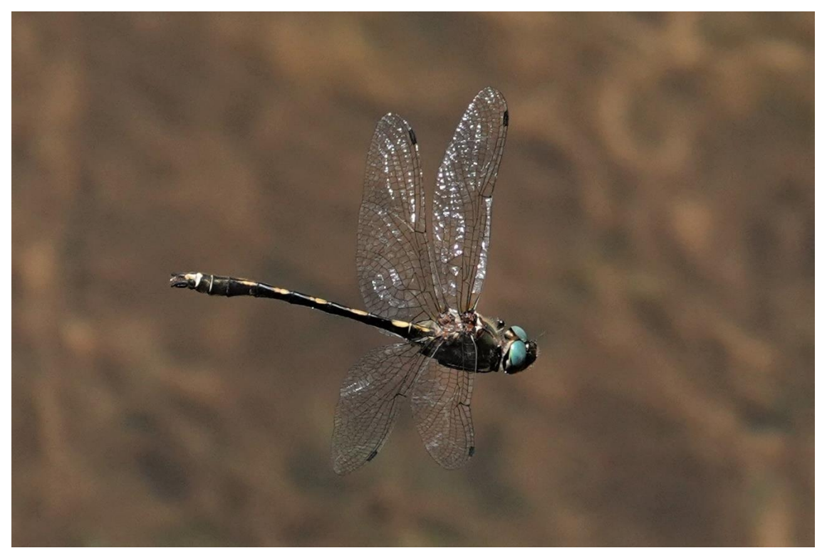
Orange-spotted Emerald (Martin)

Fairly quickly we were seeing Orange-spotted Emeralds and we devoted a lot of time to try to photograph them in flight. We were also lucky enough to see a mating pair perched. Occasionally a Splendid Cruiser passed by, but it was not until later in the afternoon that we had a chance to have more prolonged views of this rare dragonfly.