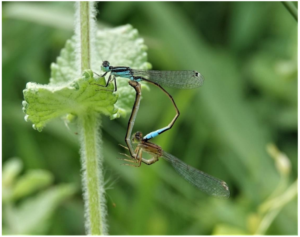
Iberian Bluetail (Martin)

We stopped beside the spectacular Roman Aqueduct of Los Milagros, complete with nesting White Storks, including a chick making its first practice flights and Glossy Ibis feeding in the canal below it. Our final stop was upstream on the Guadiana, at the town of Medellín: here we walked a short distance along edge of river and there were numerous Iberian Bluetails mating.