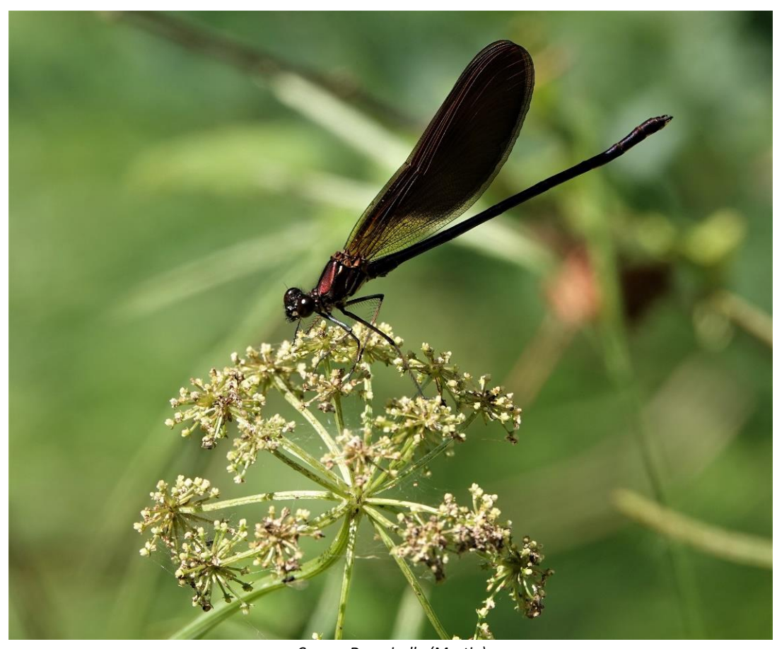
Copper Demoiselle (Martin)