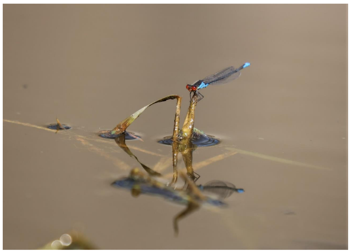
Red-eyed Damselfly (Delia)