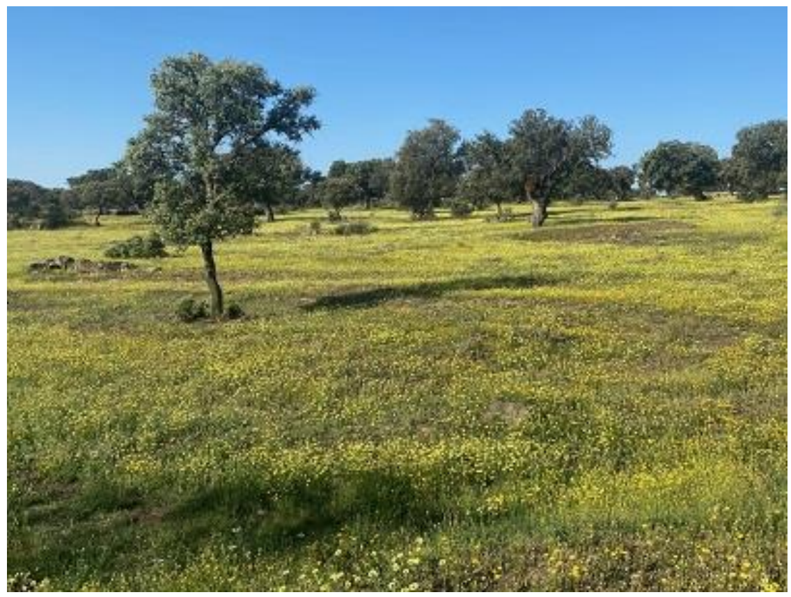
Dehesa in bloom (Martin)

It was another hot and sunny day. Delia on her pre-breakfast walk had a wonderful encounter with a Hoopoe . We set off just before 09.00, stopping a couple of times to photograph the extraordinary flowery pastures, almost unique for this time of the year, thanks to the wet spell in early June.