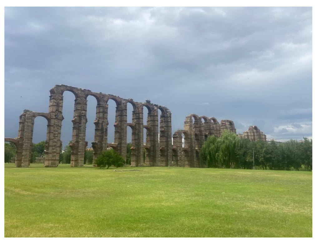
Aqueduct of Los Milagros (Martin)

We stopped beside the spectacular Roman Aqueduct of Los Milagros, complete with nesting White Storks, including a chick making its first practice flights and Glossy Ibis feeding in the canal below it. Our final stop was upstream on the Guadiana, at the town of Medellín: here we walked a short distance along edge of river and there were numerous Iberian Bluetails mating.