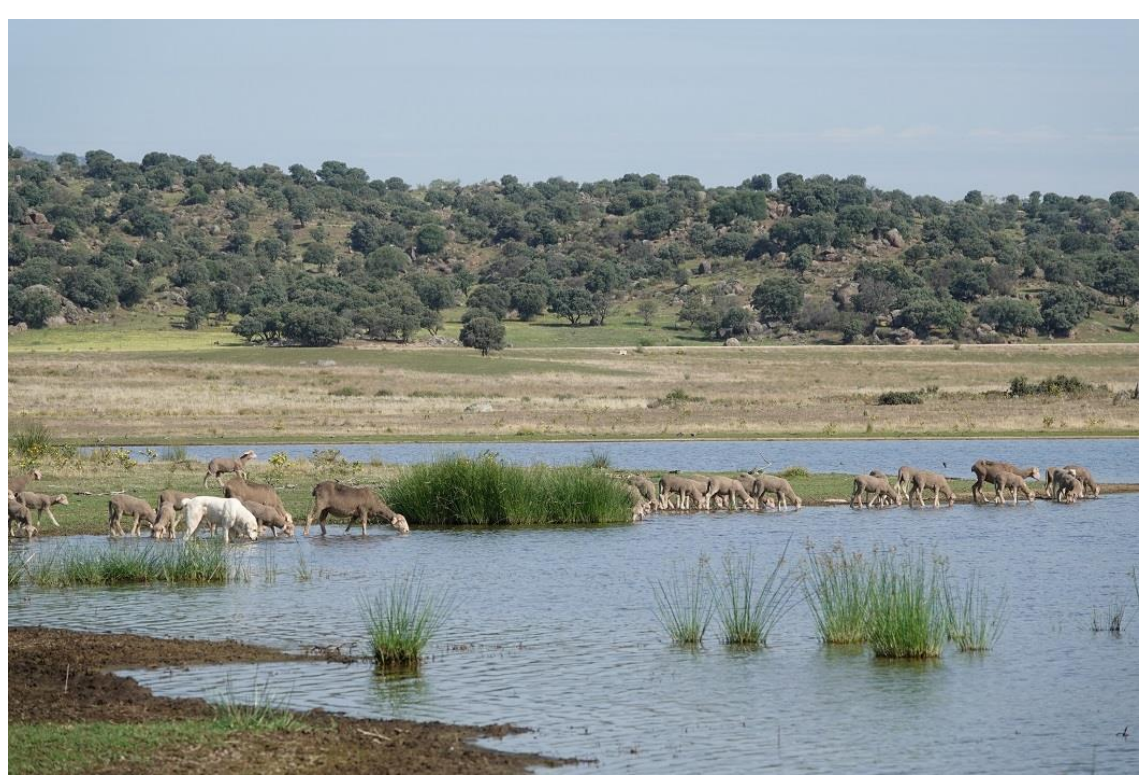
Alcollarín Reservoir (Martin)