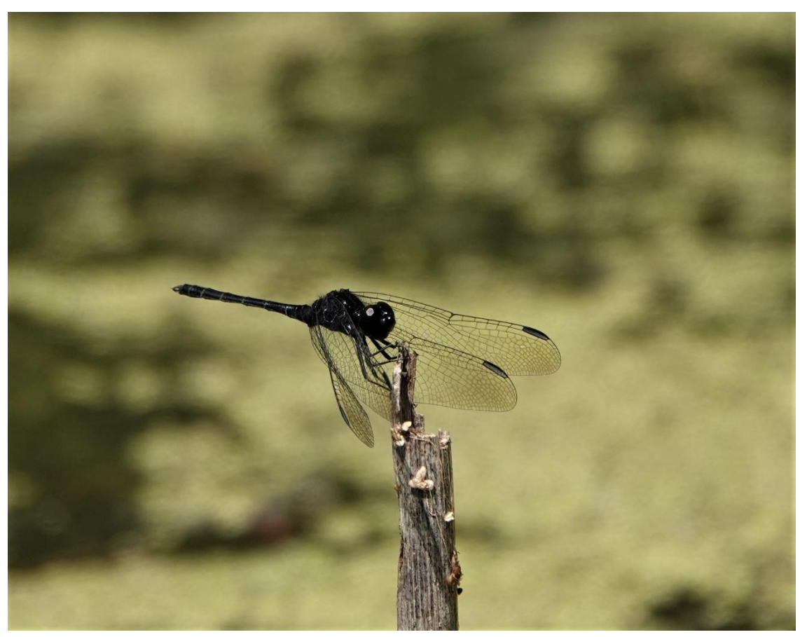
Black Percher (Martin)