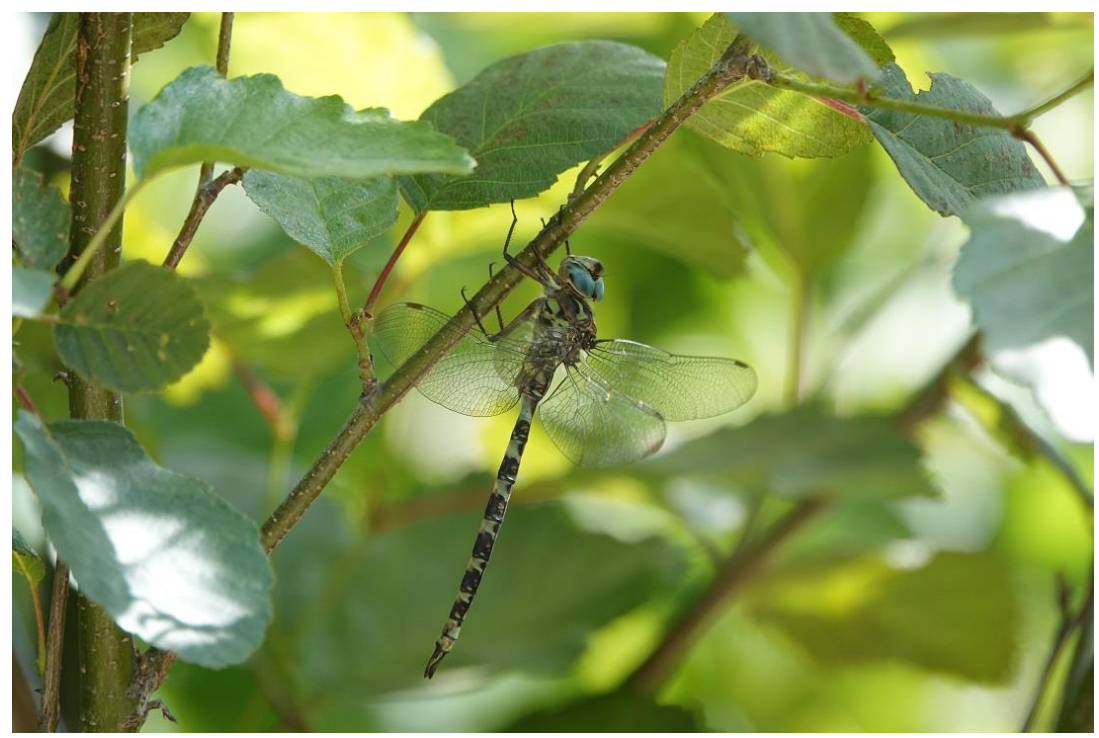
Western Spectre (Martin)