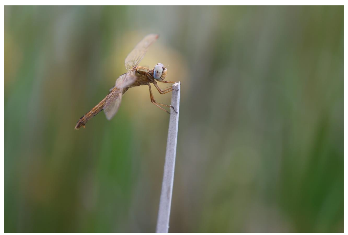
Red-veined Darter (Delia)

It was a hot sunny day and we headed south to the nearby reservoir of Alcollarín. This relatively new water body is surrounded by open woodland. We made a first stop on the western shore, just as a large flock of sheep were coming down to drink. Little Ringed Plovers and a Common Sandpiper were present, as well as some noisy Egyptian Geese. The rushes beside the water were full of Iberian Bluetails and as the air got warmer the number of Northern Banded Groundlings increased. We also found Red-veined Darters.