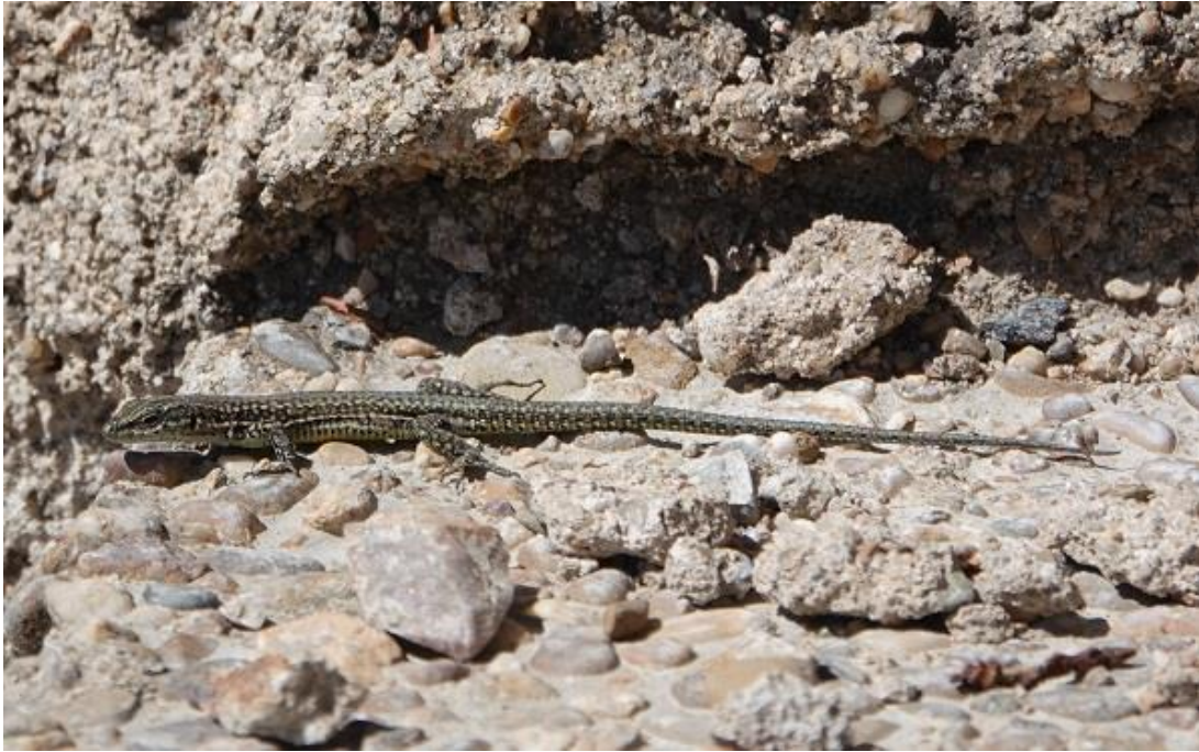
Geniez's Wall Lizard

We descended into the Almonte valley, beautiful steep woodland and scree slopes, with dramatic rocky outcrops and pretty villages. Crossing the vast dehesas took us onto the plains of Belén where Northern Wheatears and Whinchats were on the wires and Bee-eaters were out foraging. We ended the afternoon walking round the historic part of the town of Trujillo, again offered great views from the ancient castle and as we explored the narrow streets, Crag Martins and swifts passed overhead.