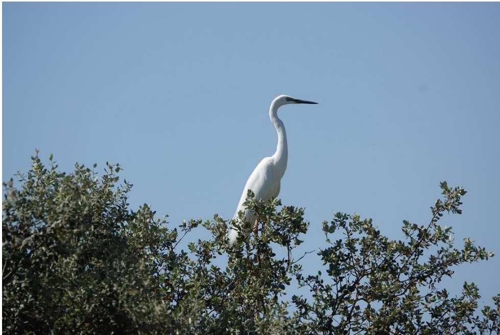
Great White Egret

We bid farewell to Casa Rural El Recuerdo and headed back towards Madrid, but with time to make some birding stops. First of all, we visited the Arrocampo Reservoir, walking beside the marsh and being rewarded with sightings of Ferruginous Duck , Little Bittern , Cattle Egrets , Glossy Ibis and Purple Swamphen . Savi's Warblers were singing and we even had brief views of Bearded Tit . Cetti's Warblers were much more obliging, sitting out in the open, Zitting Cisticolas and Stonechats perched on brambles. Gull-billed Terns were in good numbers. Following coffee we followed a track to look at Bee-eaters and we also found another Glossy Ibis , Great White Heron and Common Shelduck .