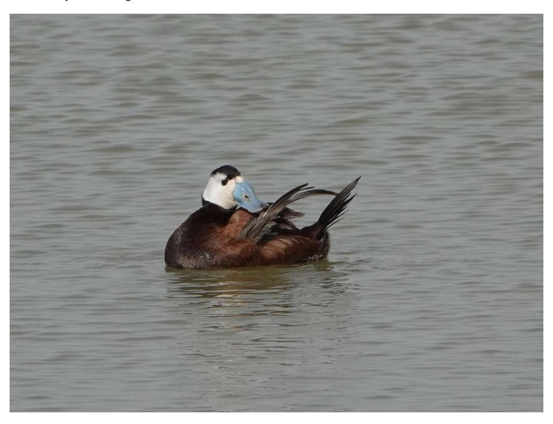
20<sup>th</sup> February 2023: Lagunas of Alcazar de San Juan and return to Madrid

On our return we stopped at the silos in Trujillo to watch the Lesser Kestrels recently returned from West Africa, most of the birds that were settled to perch were females, but we did also get a view of two smart male birds.