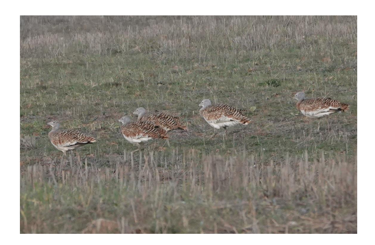
14<sup>th</sup> February 2023: Campo Lugar plains, Madrigalejo, Vegas Altas, Moheda Alta and Palazuelo

We enjoyed another dry day today, mainly sunny with a fresh easterly wind. Heading south we stopped at the edge of the Campo Lugar plains to have superb views of a group of male Great Bustards . The light was excellent, and we watched them at length as they fed and preened. The landscape changed dramatically as we continued just a few kilometres south to the flat flood plains of the Guadiana basin. Close to Madrigalejo we stopped beside an old gravel pit and watched fly-bys by two Great Spotted Cuckoos chasing each other. Common Cranes , White Storks , Northern Lapwings and Golden Plover were scattered across the surrounding pasture. Further on down the road we found several Iberian Grey Shrikes as well as a Blackwinged Kite .