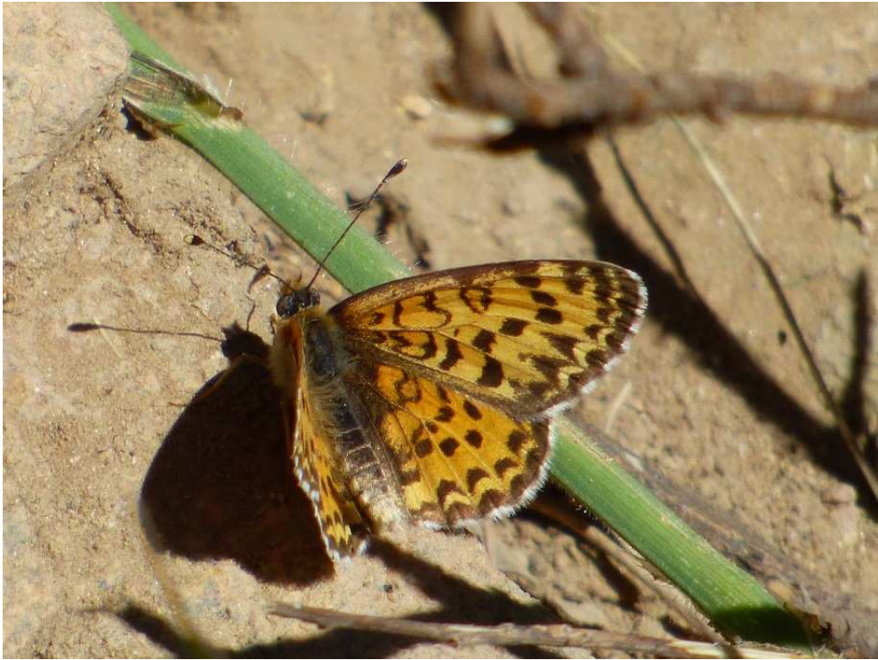
Lesser Spotted Fritillary