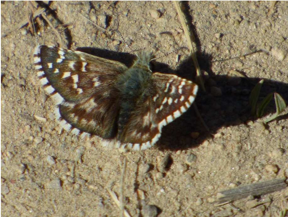
Oberthür's Grizzled Skipper

We stopped for coffee at the Parador of the Gredos and then retraced our steps to the pass where we had stopped two days earlier. Here Knapweed Fritillaries were again evident and we found an extraordinary Owlfly .