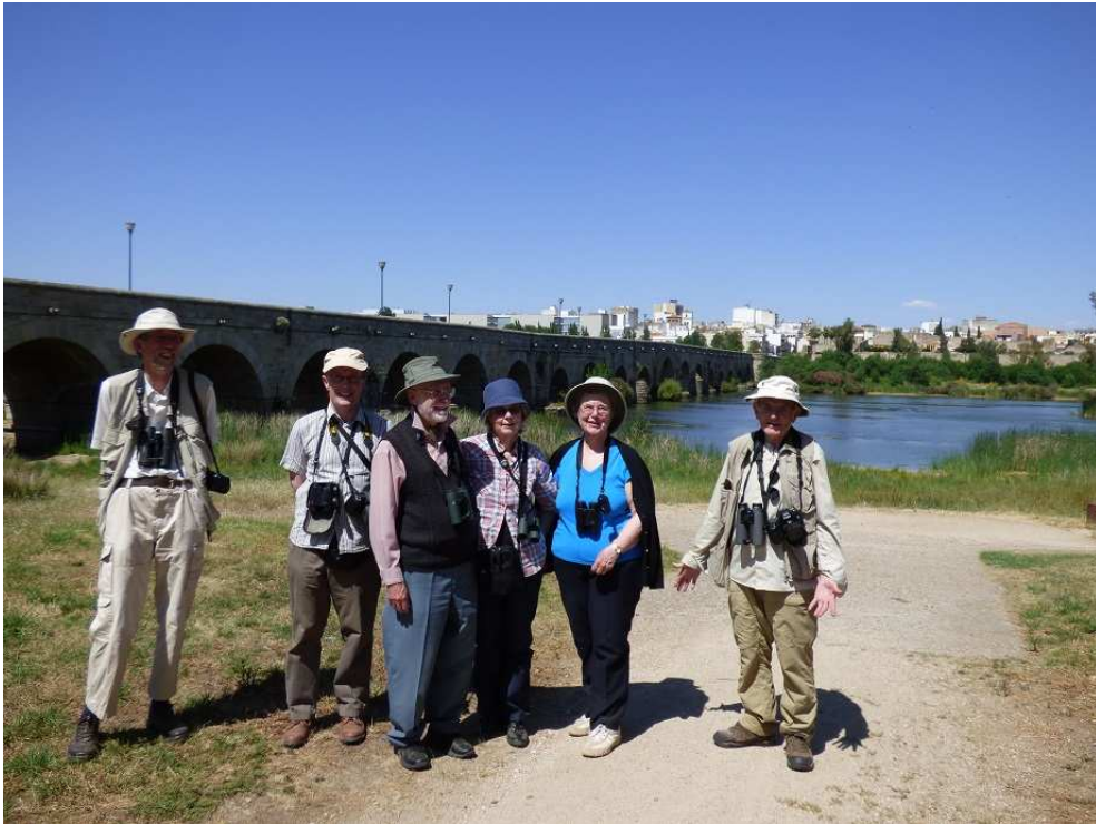
The group beside the Roman Bridge in Mérida